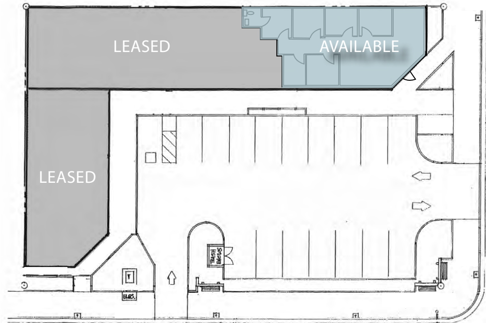
*FLOOR PLAN NOT TO SCALE