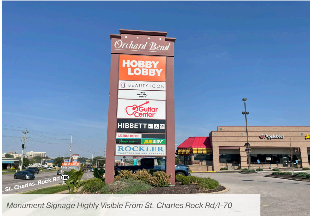
Monument Signage Highly Visible From St. Charles Rock Rd/I-70