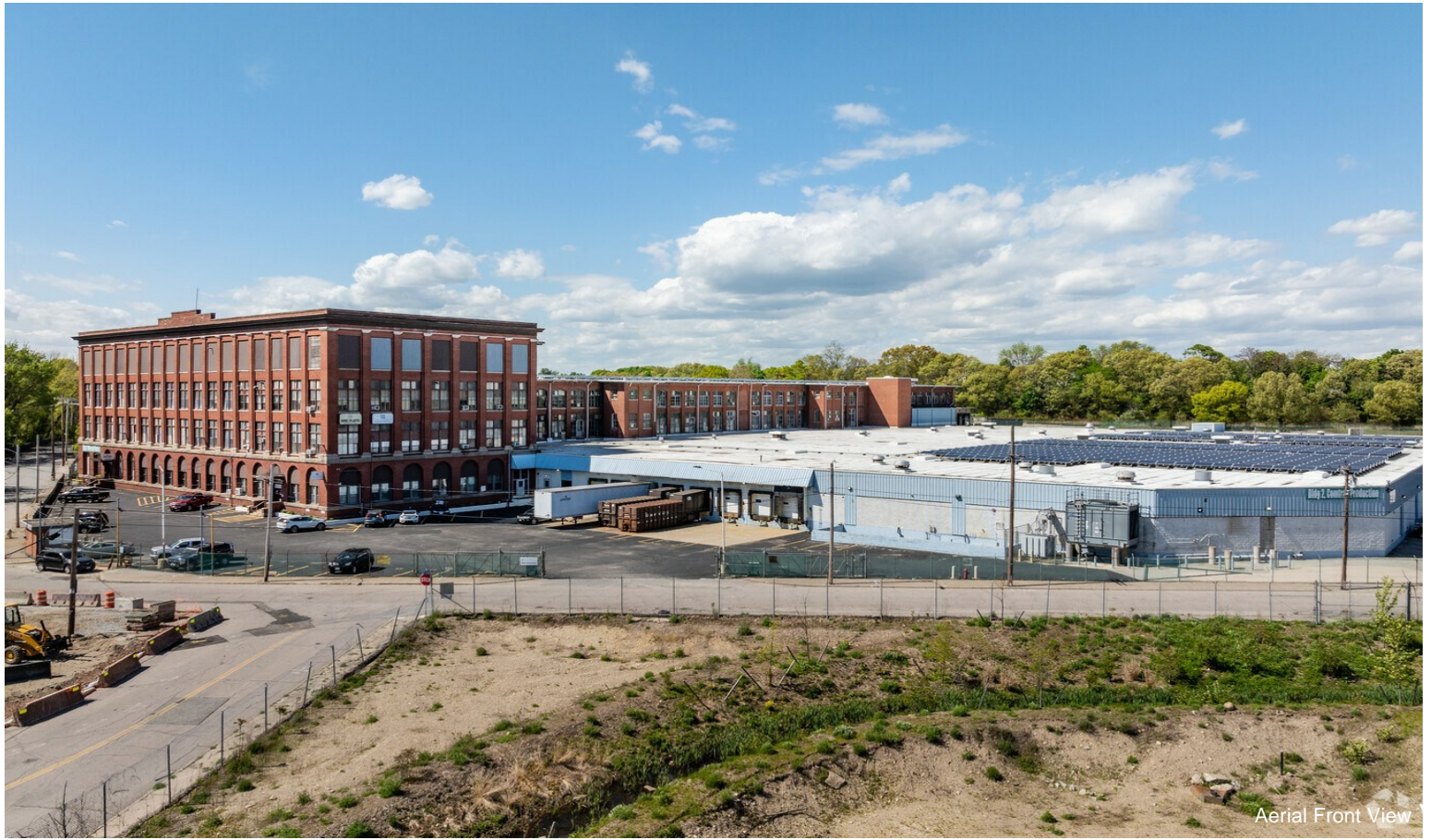
Aerial Front View