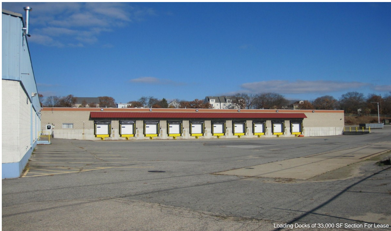
Loading Docks of 33,000 SF Section For Lease