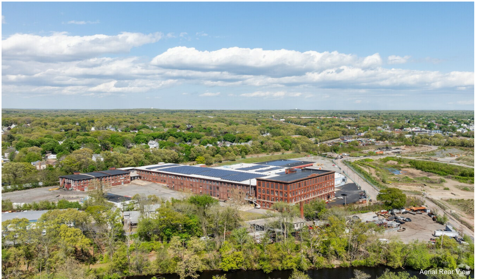
Aerial Rear View