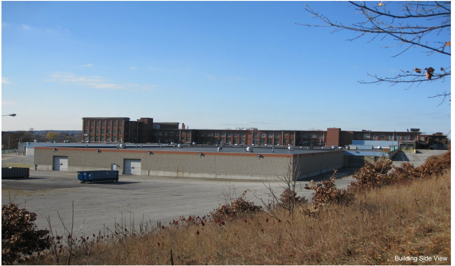
Building Side View