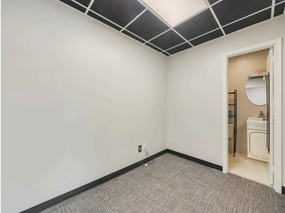
Office Space - 104