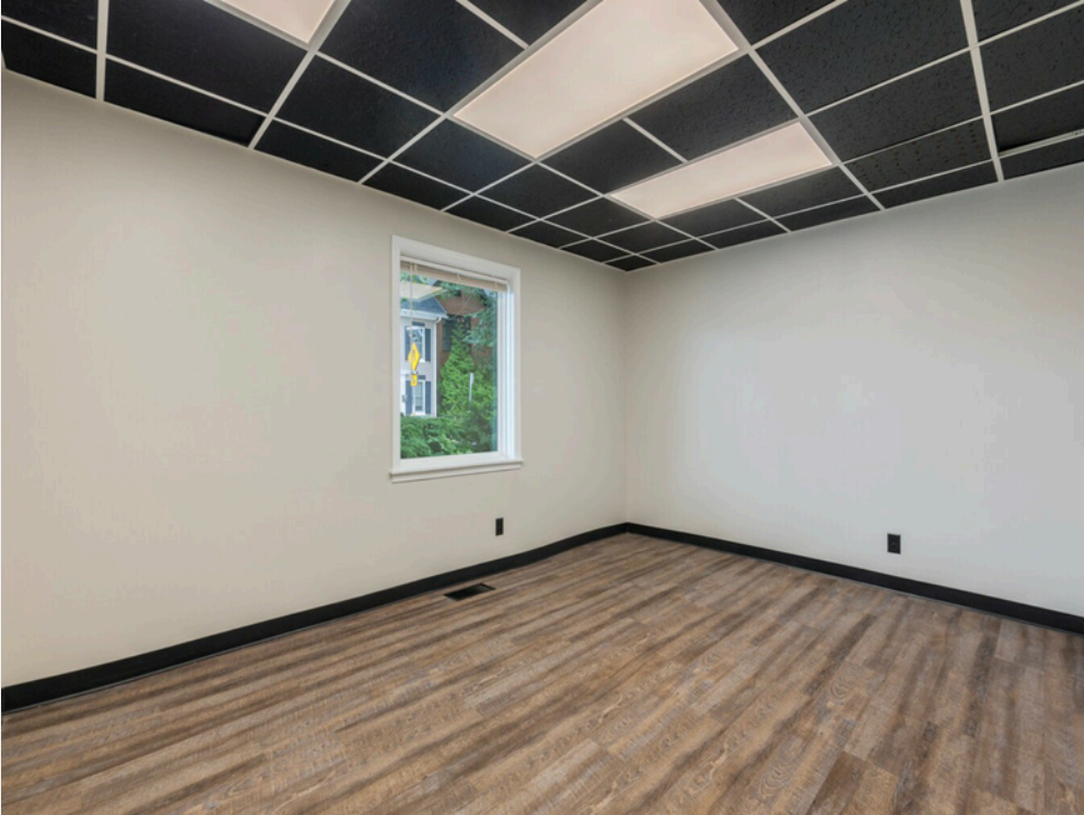
Office Space - 104