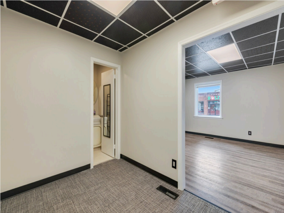
Office Space - 104