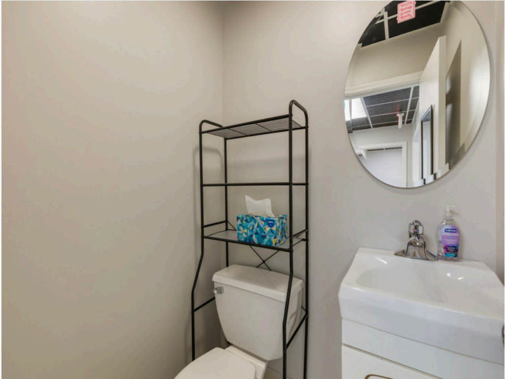
Office Space - 104