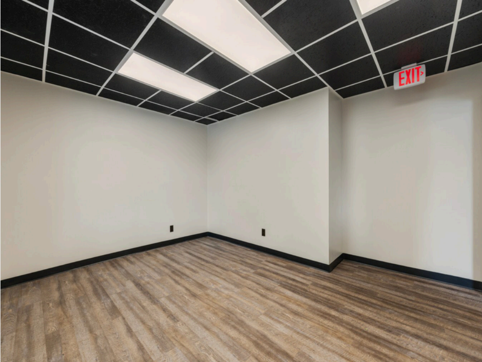
Office Space - 104