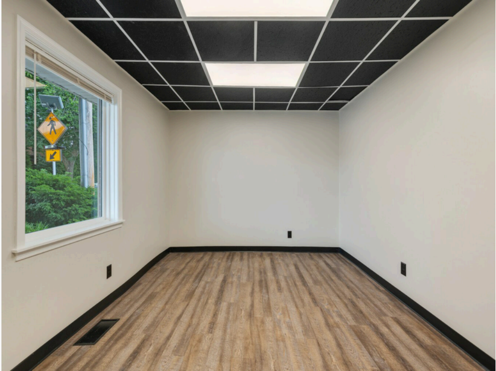
Office Space - 104