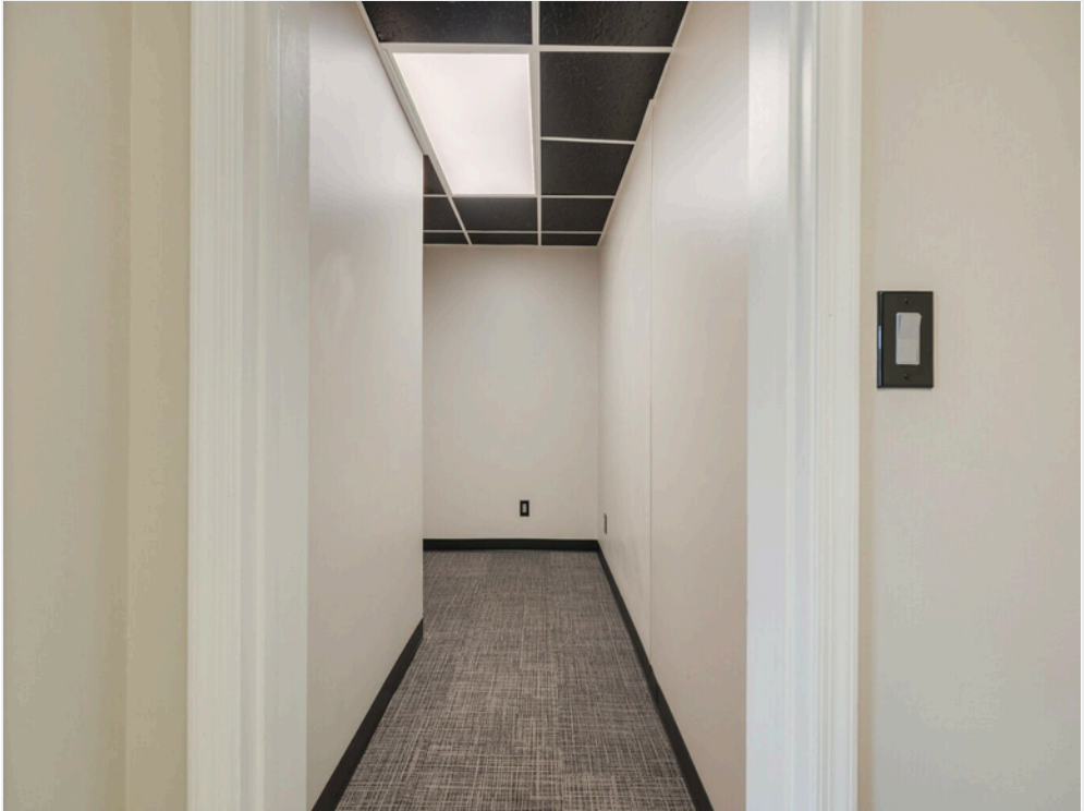
Office Space - 104