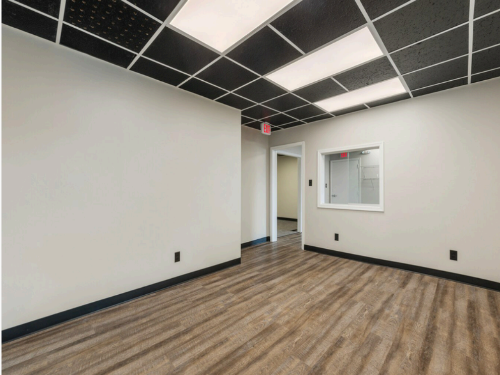
Office Space - 104