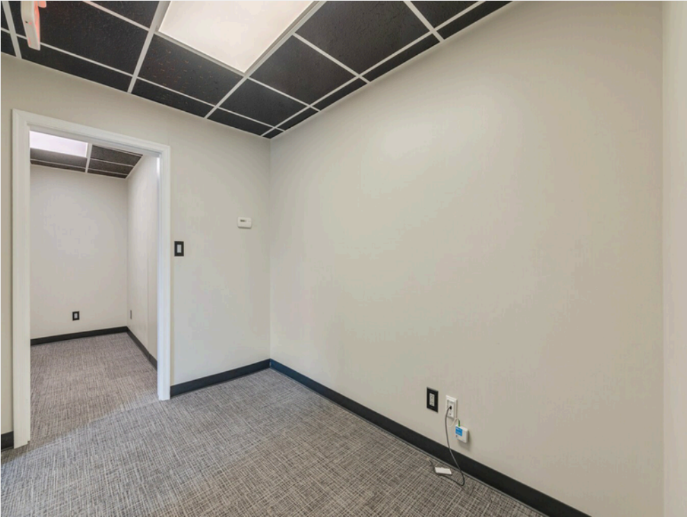
Office Space - 104