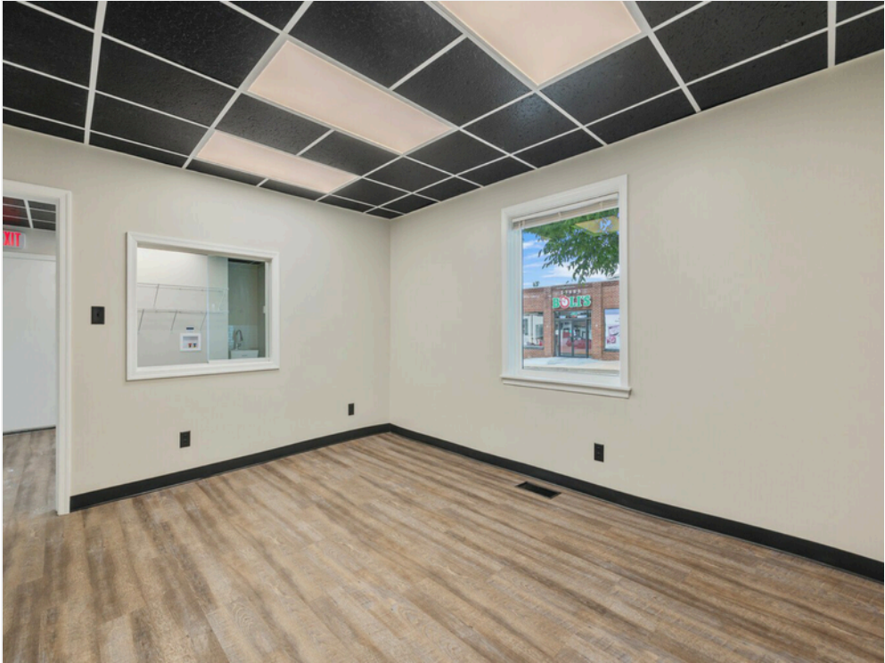
Office Space - 104