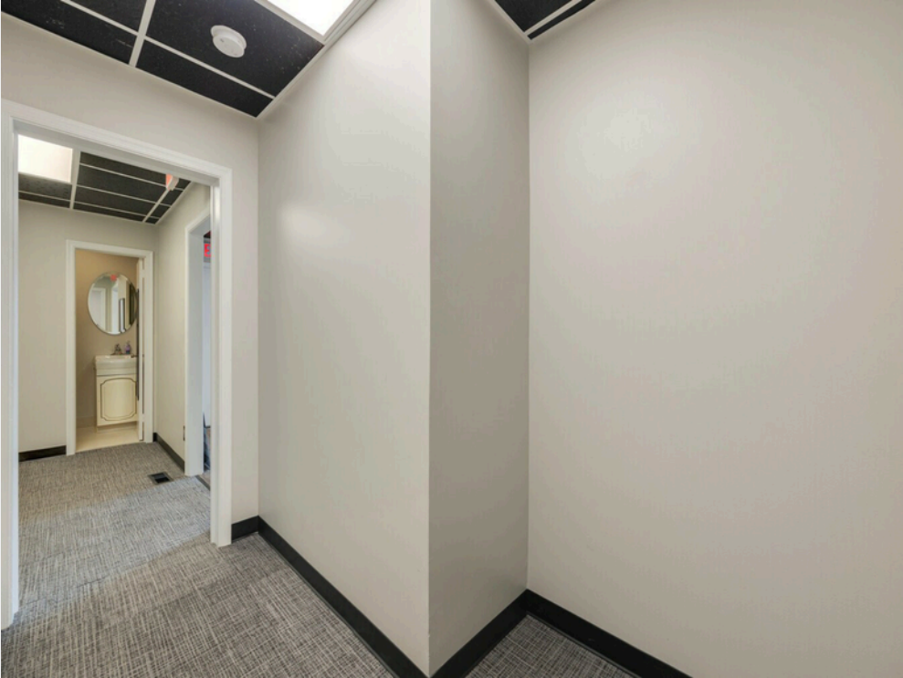
Office Space - 104