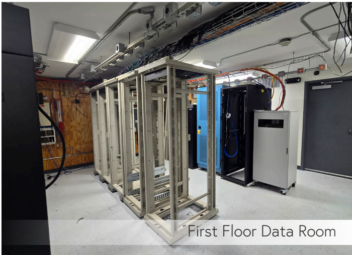
First Floor Data Room