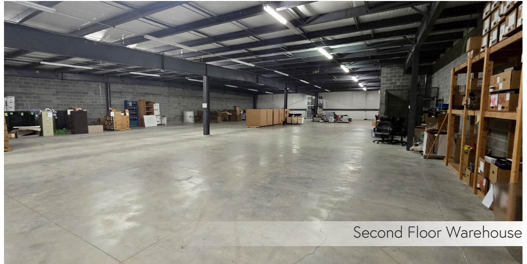
Second Floor Warehouse