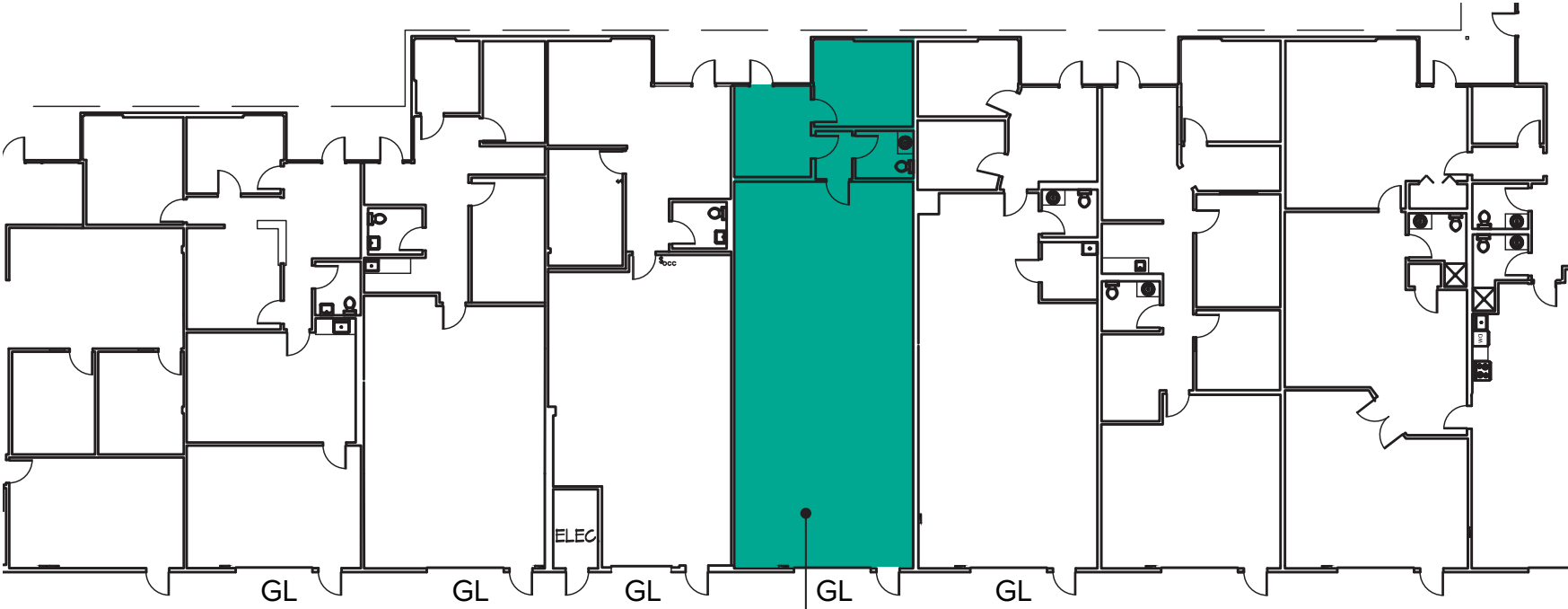
SUITE 25518 1,703 SF (391 SF ofc)