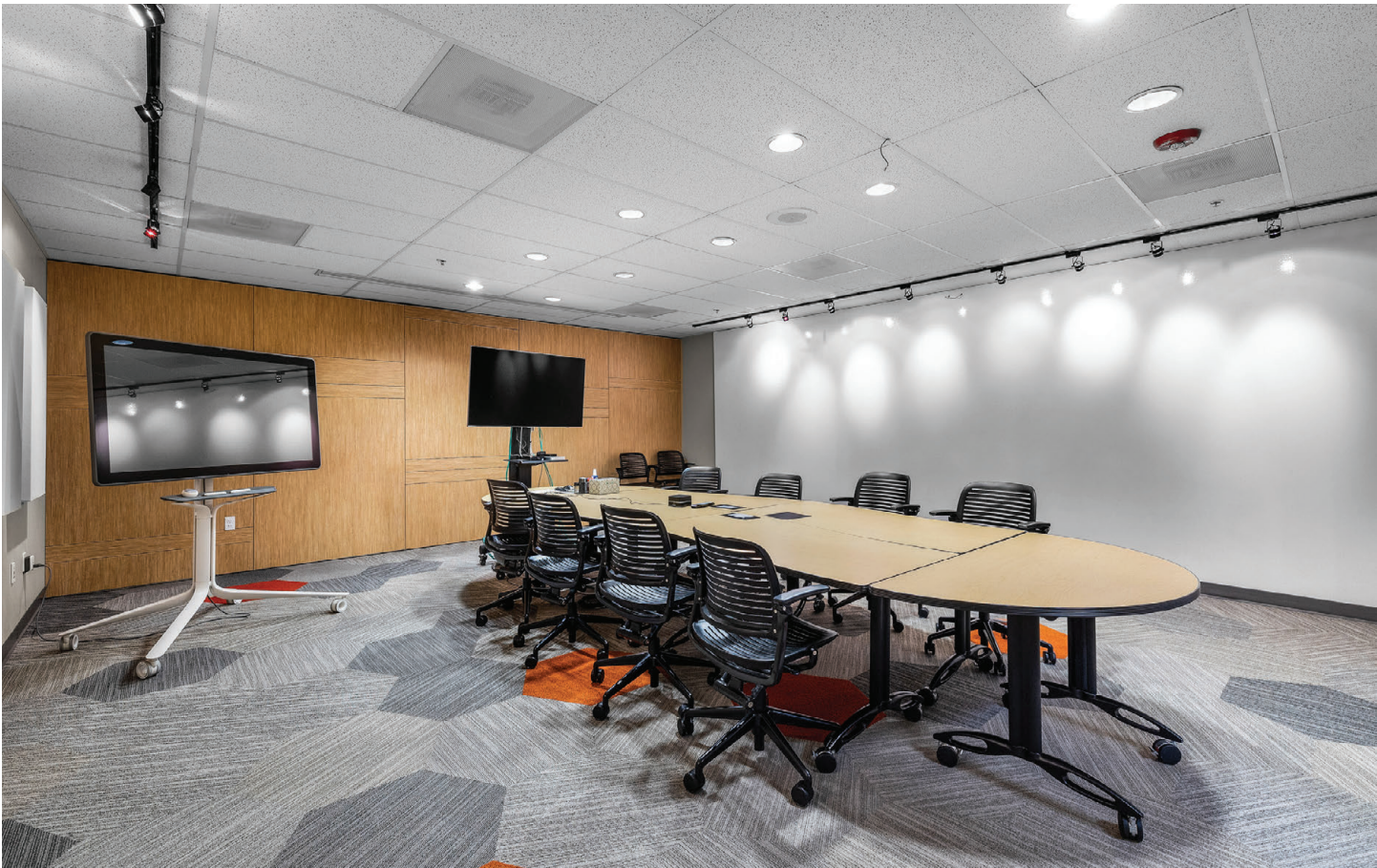
Current photos of the space that will be Suite 25.