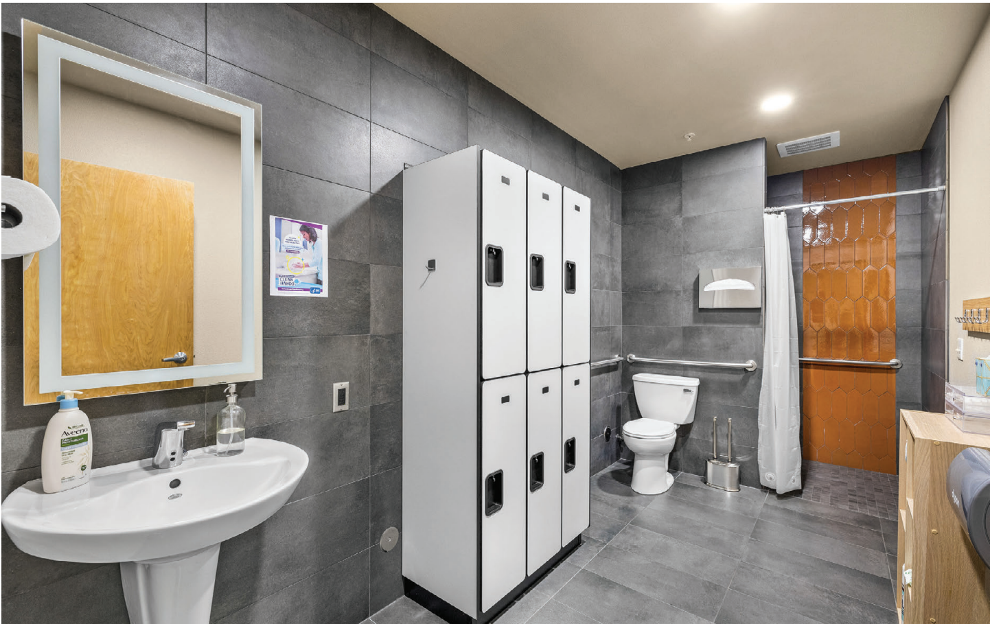
Current photos of the space that will be Suite 25.