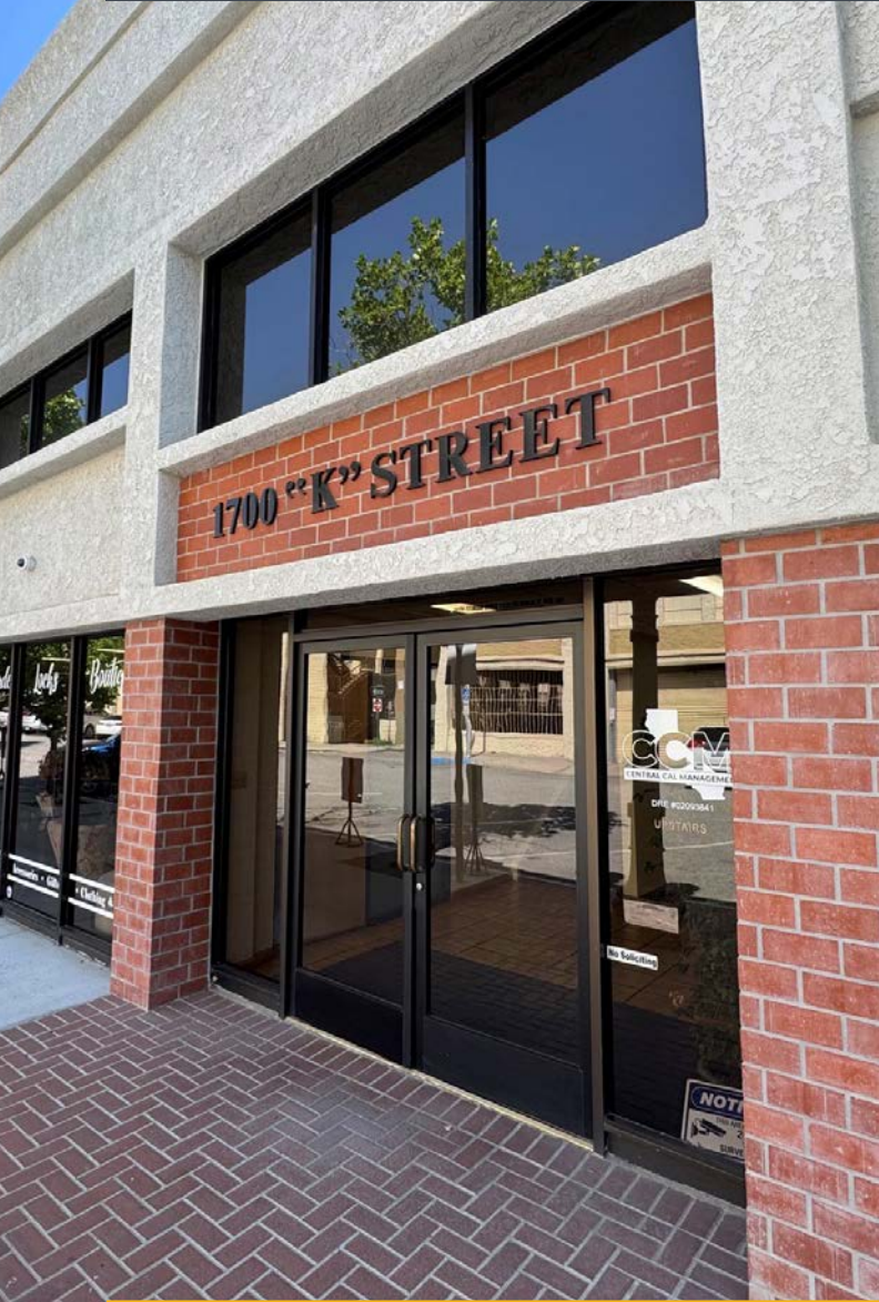
Suite 220 2,842 SF

1700 K Street - Suite 220 - Bakersfield, CA