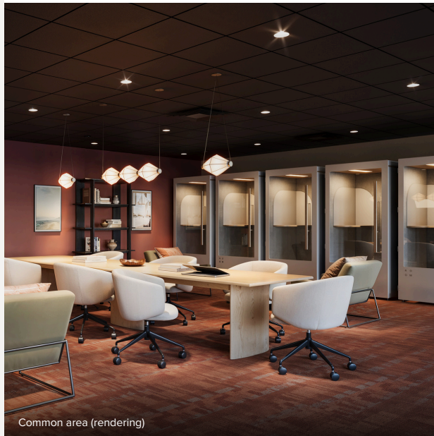
Common area (rendering)

Industrious is the highest rated workplace for customer satisfaction in the industry – offering premium coworking, private offices, and conference facilities with flexible terms and all-inclusive pricing.