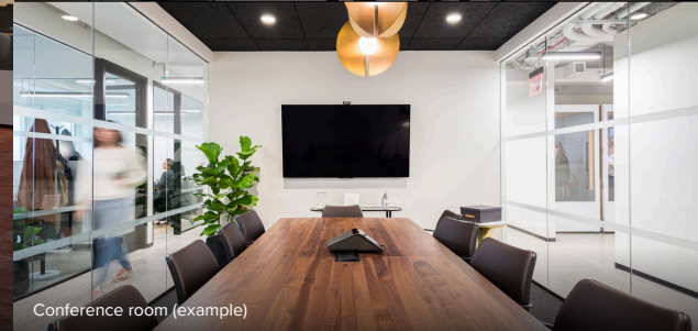
Conference room (example)