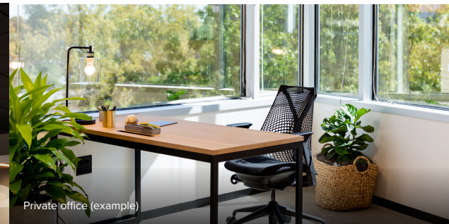
Private office (example)