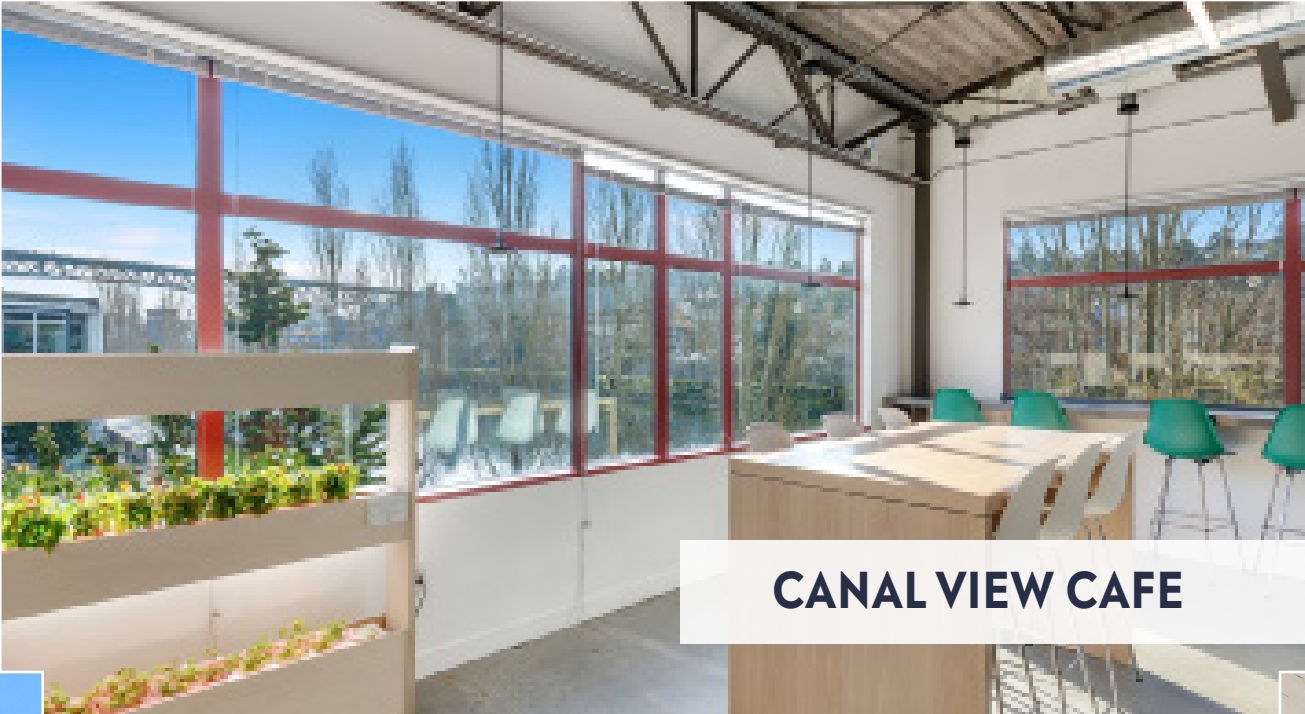
CANAL VIEW CAFE