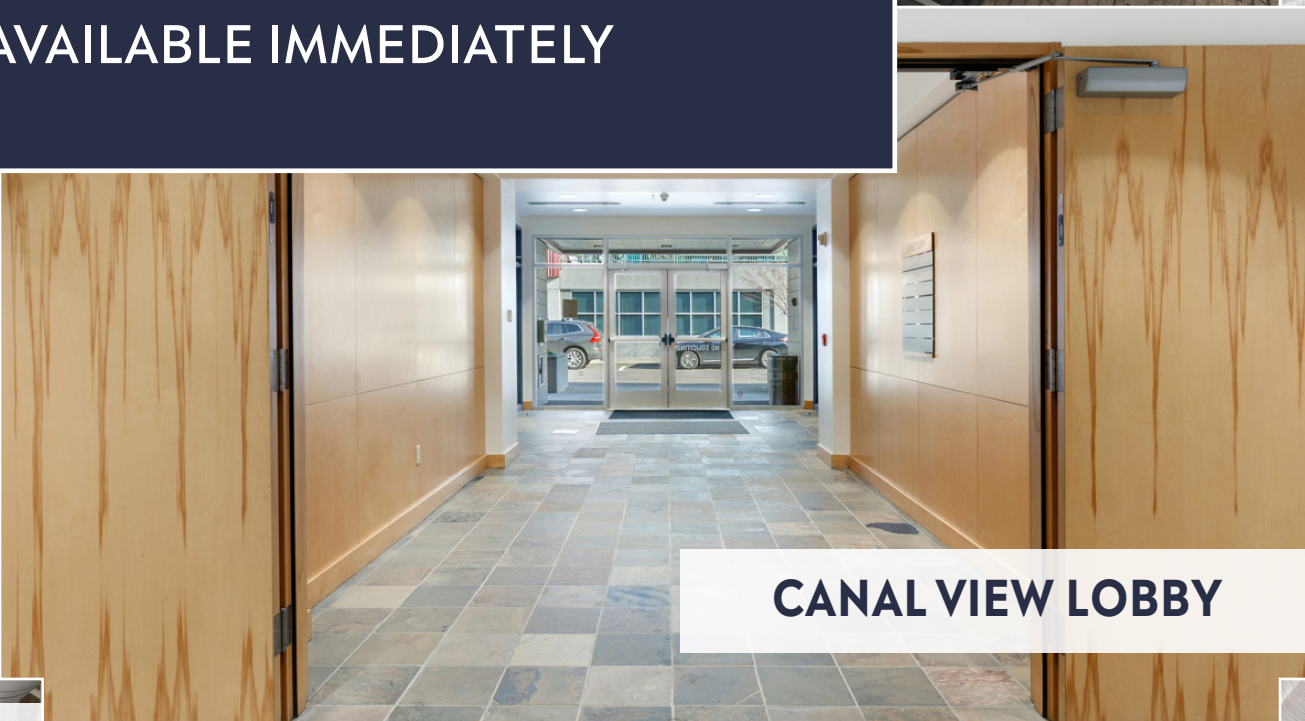
CANAL VIEW LOBBY