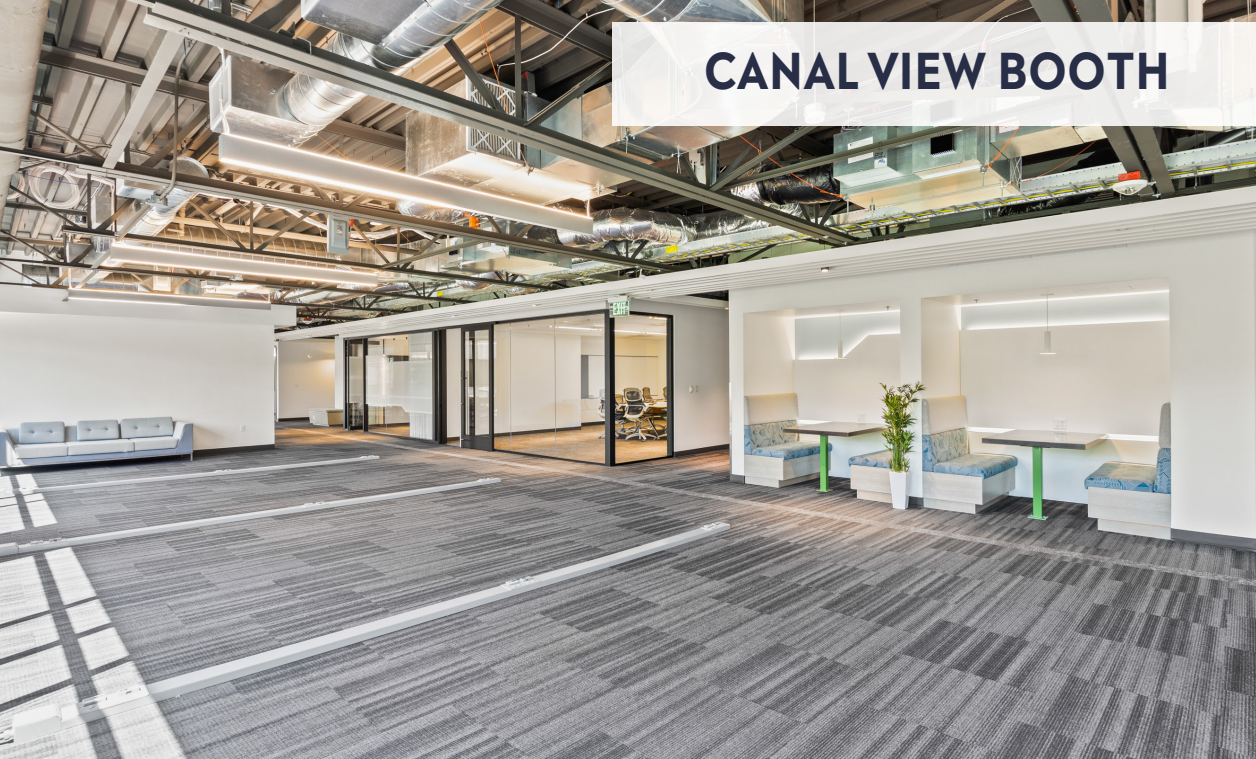
CANAL VIEW BOOTH

FIND THE SPACE THAT WORKS FOR YOU 1,689 SF - 99,772 SF AVAILABLE IMMEDIATELY