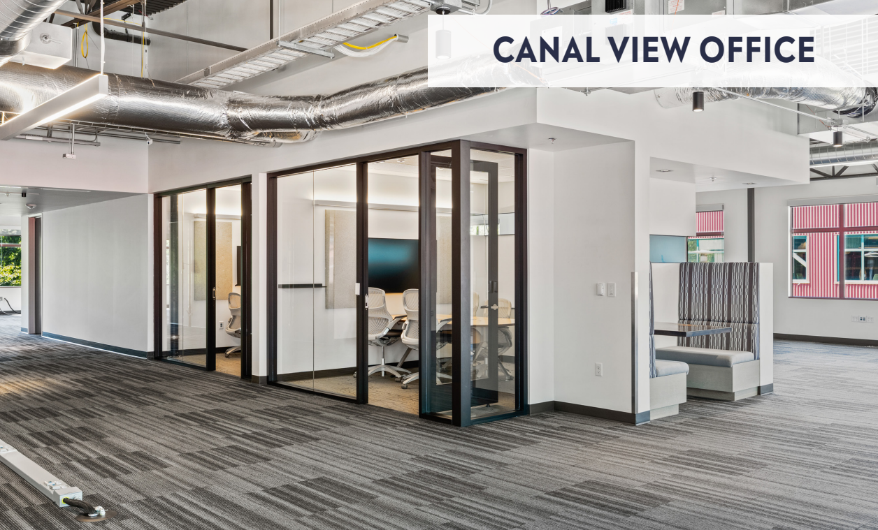
CANAL VIEW OFFICE