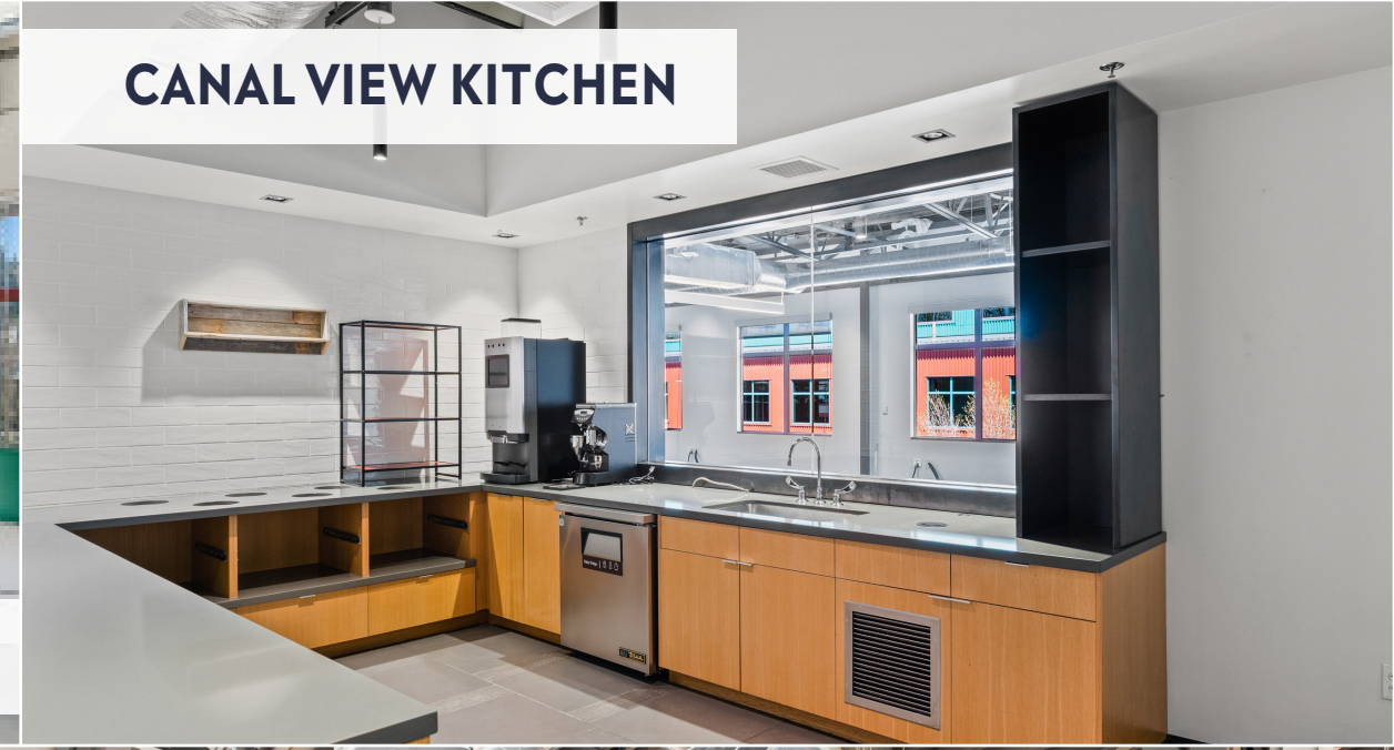
CANAL VIEW KITCHEN