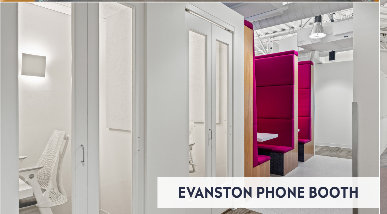
EVANSTON PHONE BOOTH