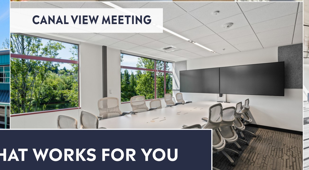
CANAL VIEW MEETING