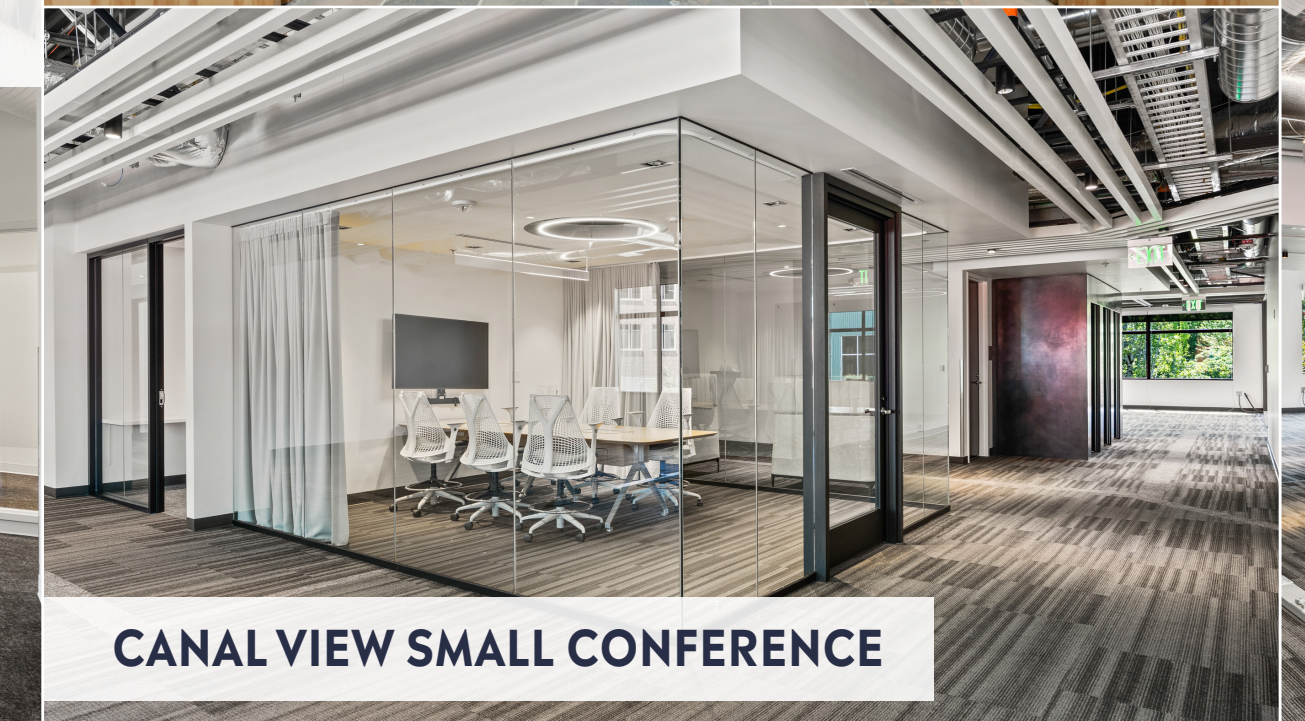
CANAL VIEW SMALL CONFERENCE