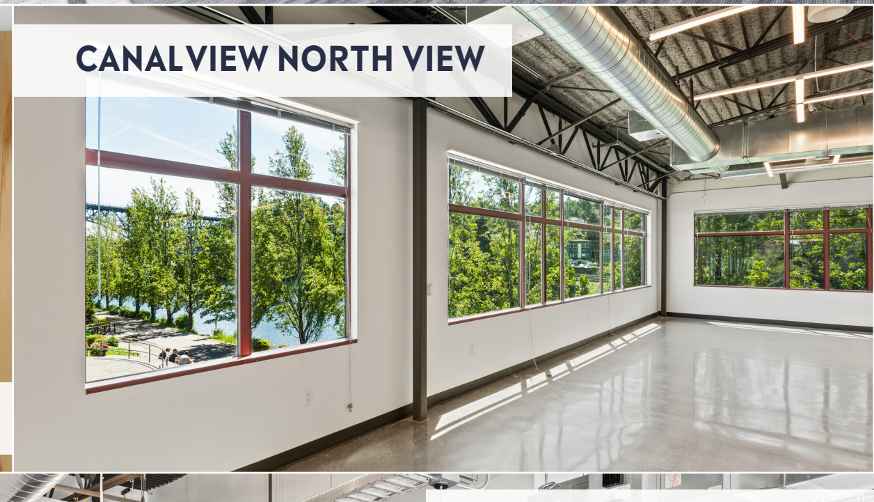
CANALVIEW NORTH VIEW