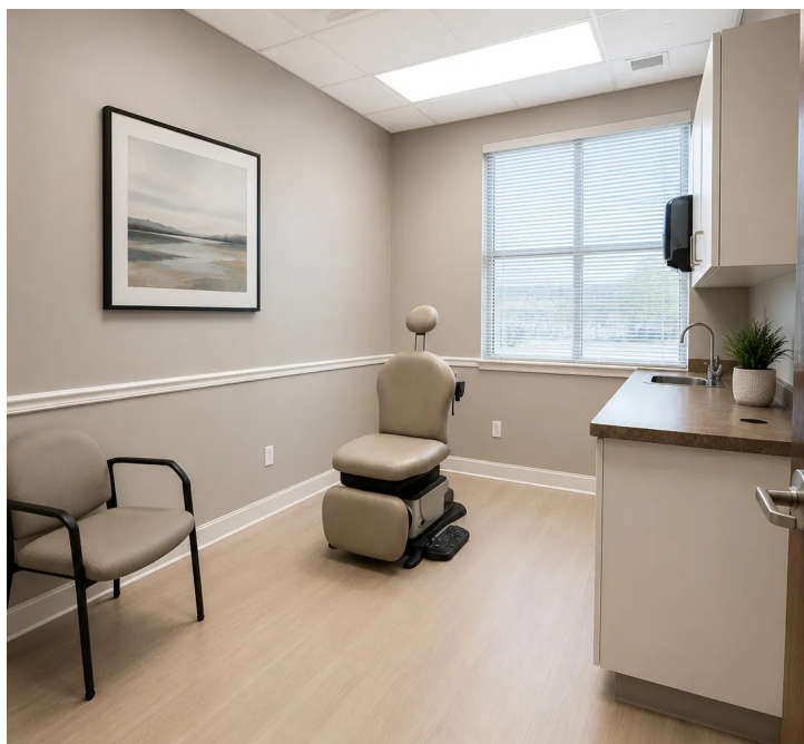
Typical Patient Exam Room