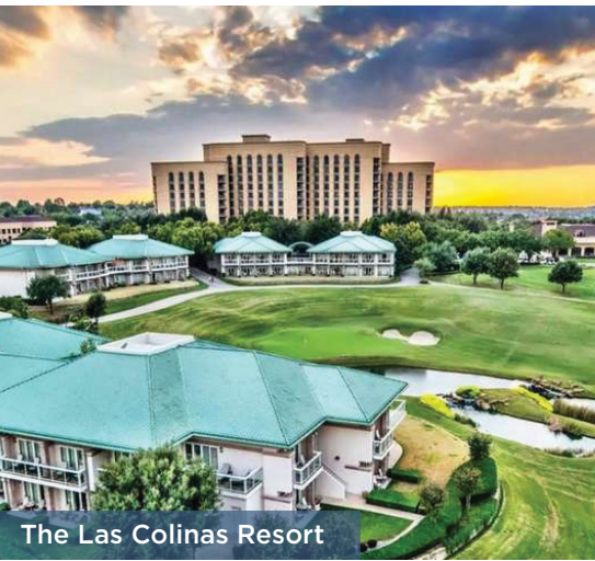
The Las Colinas Resort