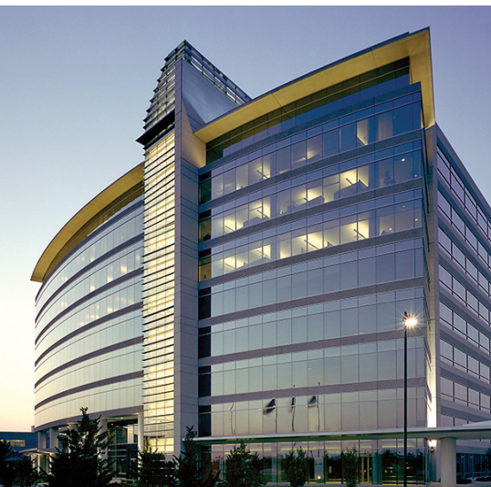
McKesson Corporation HQ

McKesson Corporation | Pioneer Natural Resources | Kimberly-Clark | NEC Corporation | Exxon Mobil | Nokia, Inc. Microsoft | Verizon | CitiGroup | Fluor Corporation | Allstate Insurance | Caterpillar | Celanese