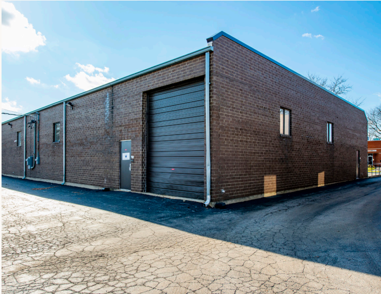
REAR DRIVE-IN DOOR