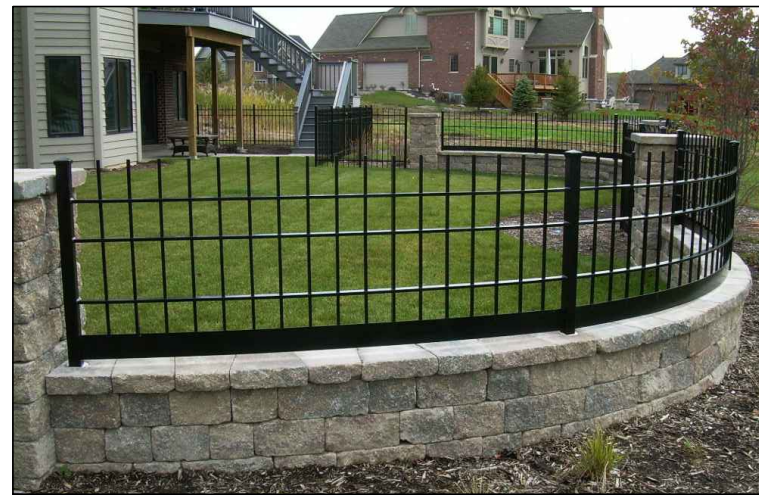
FIG. 1 SITE EXTENTS DEFINED BY FENCING AND PLANTING BEDS.

1. Base plan prepared from land survey performed by Guntlow & Associates, Inc. in February 2024. The Datum is arbitrary.