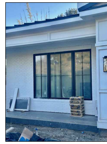
FIG. 2 PROPOSED EXTERIOR TREATMENT PAINTED BRICK FLAT BLACK WINDOW CASING