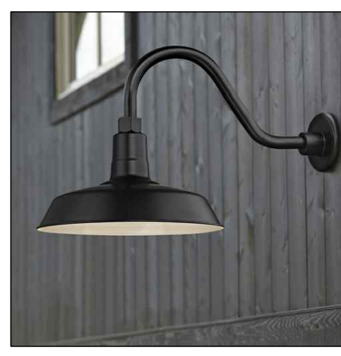
FIG. 3 FLAT BLACK SITE FIXTURES