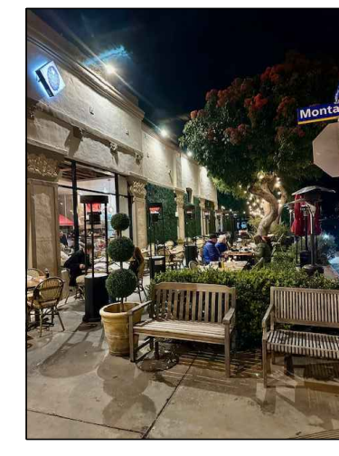
FIG. 4 AESTHETIC OBJECTIVE