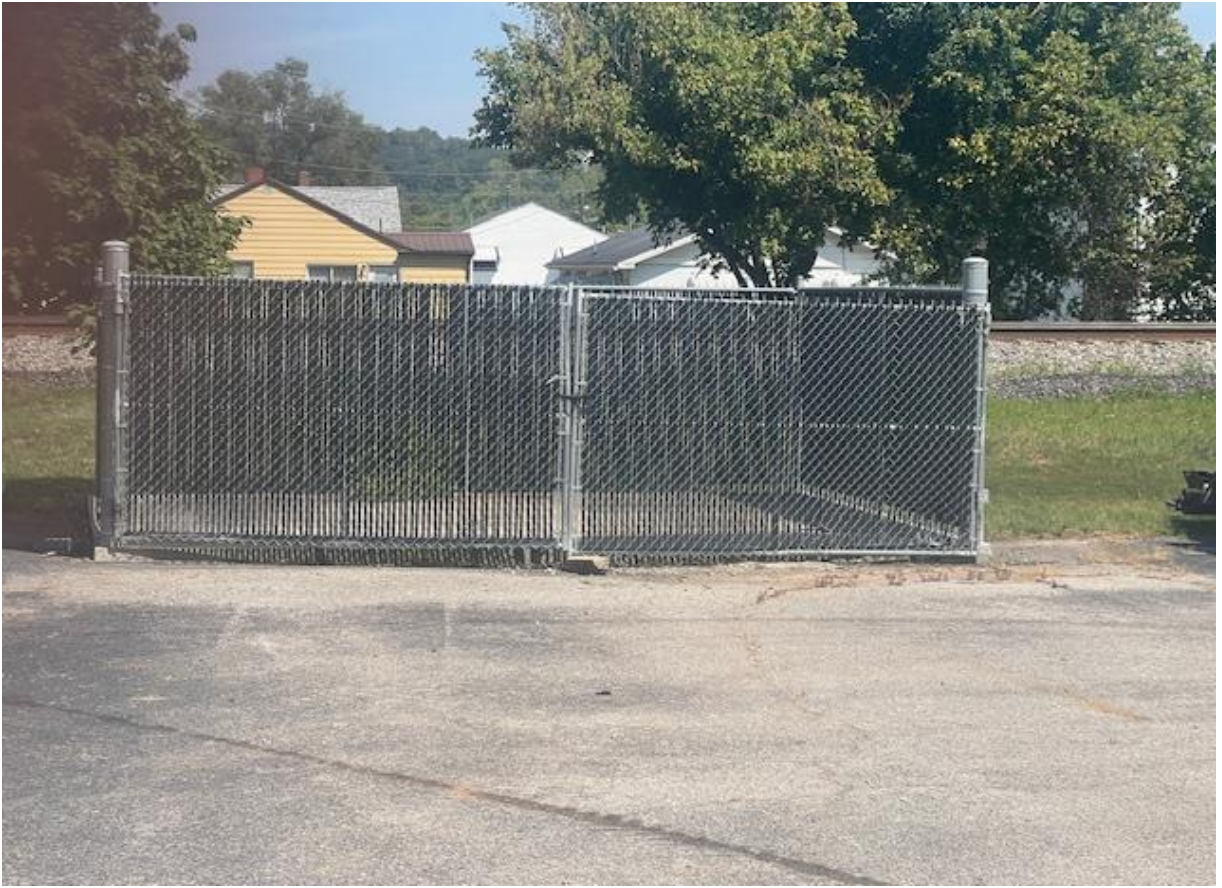
A dual dumpster fenced area (It can be removed if not needed.)