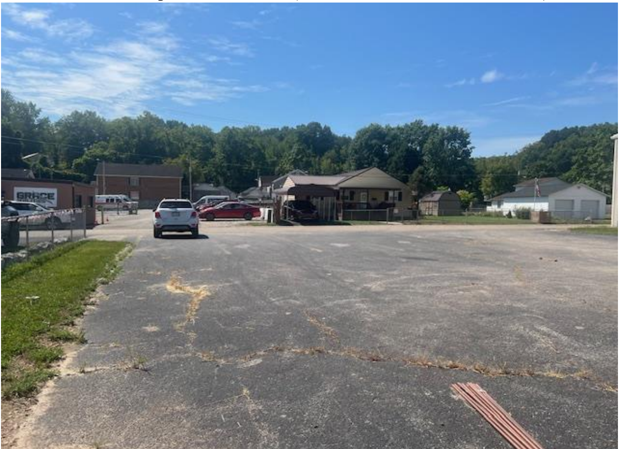
View looking from the back of the property