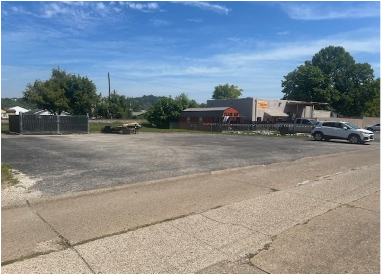
Straight on view of the property. Club K-9 doggie day care is adjacent.