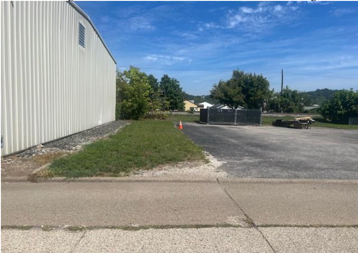
Left side of the property. An auto aftermarket supplier is in the building adjacent.