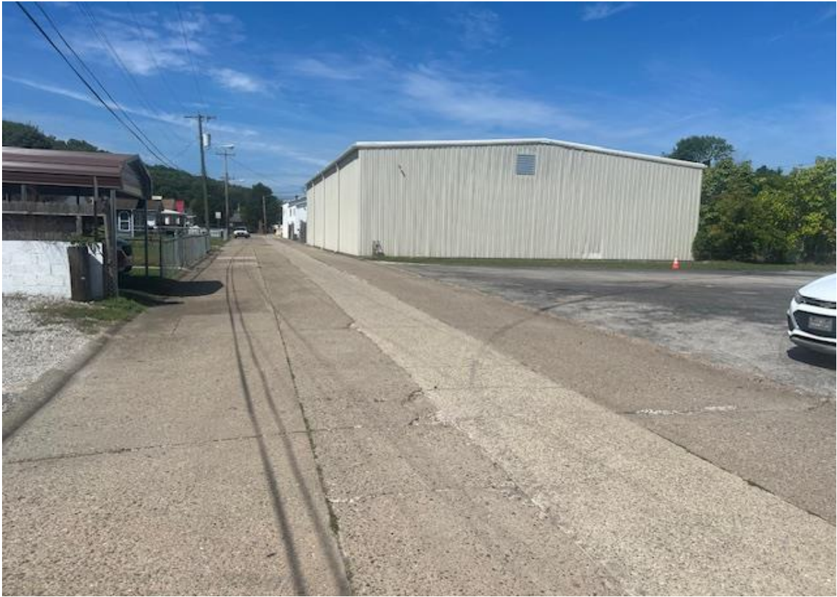
View looking toward Chestnut Street from the dead end of McClung Street