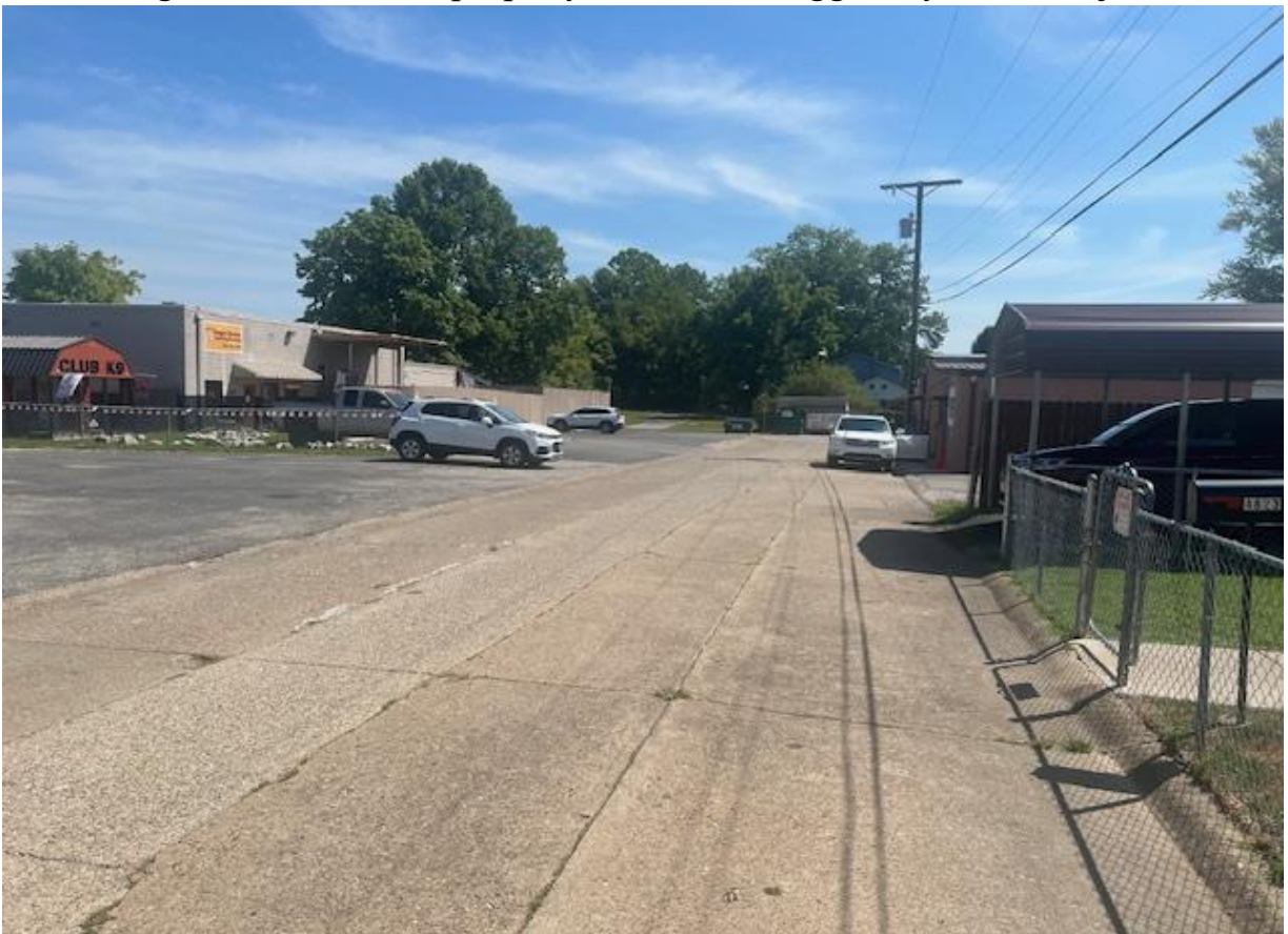
View showing the end of McClung Street