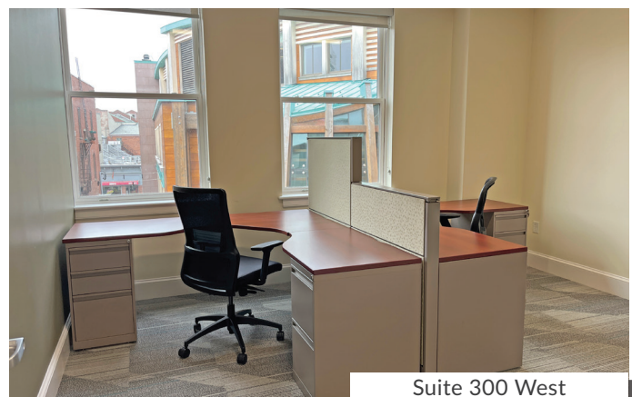
Suite 300 West