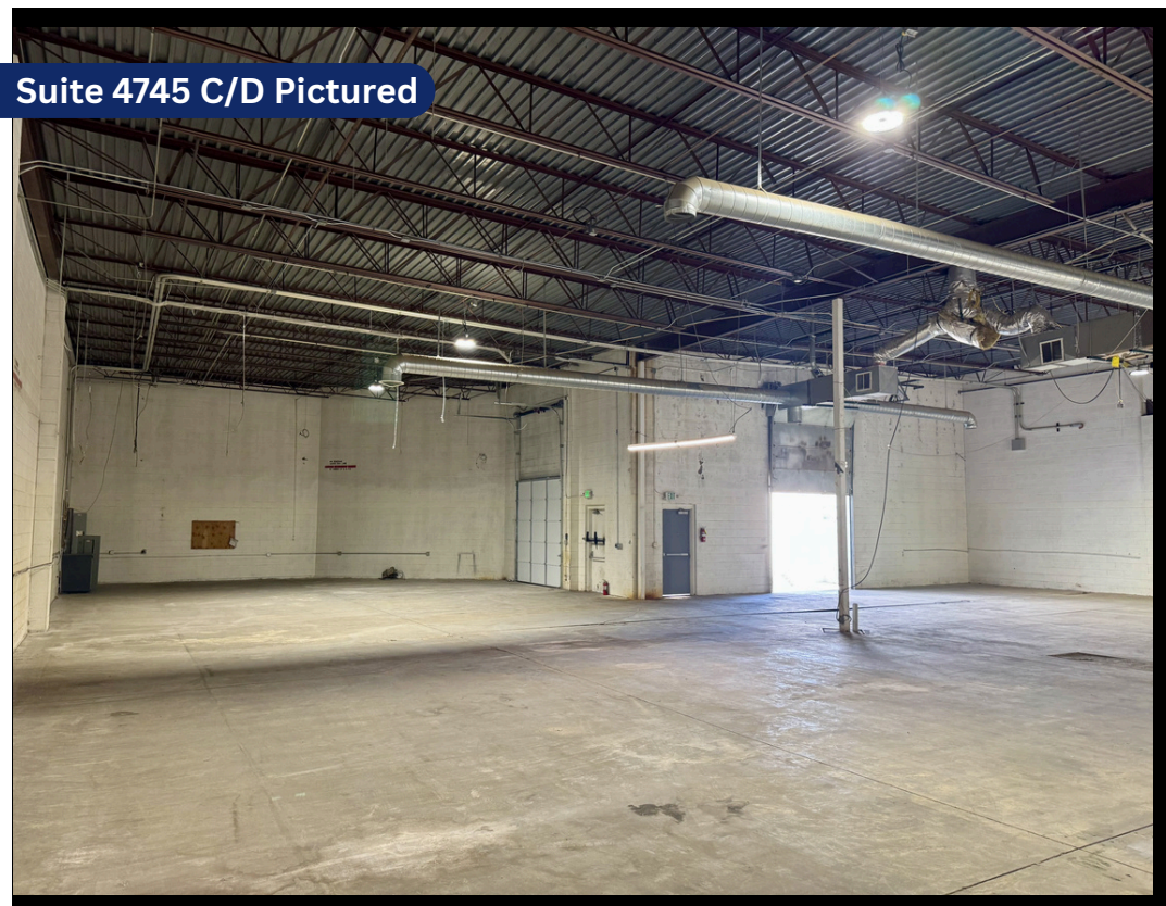
Suite 4745 C/D Pictured