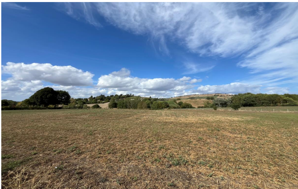
View From Site