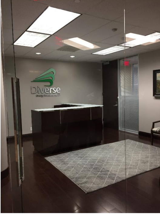
Reception off Lobby