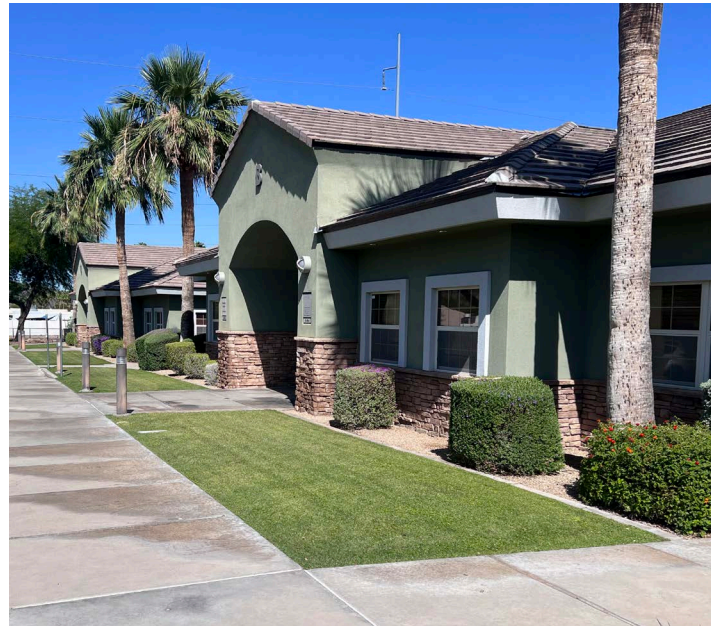
Looking Northwest at adjacent Suite B104