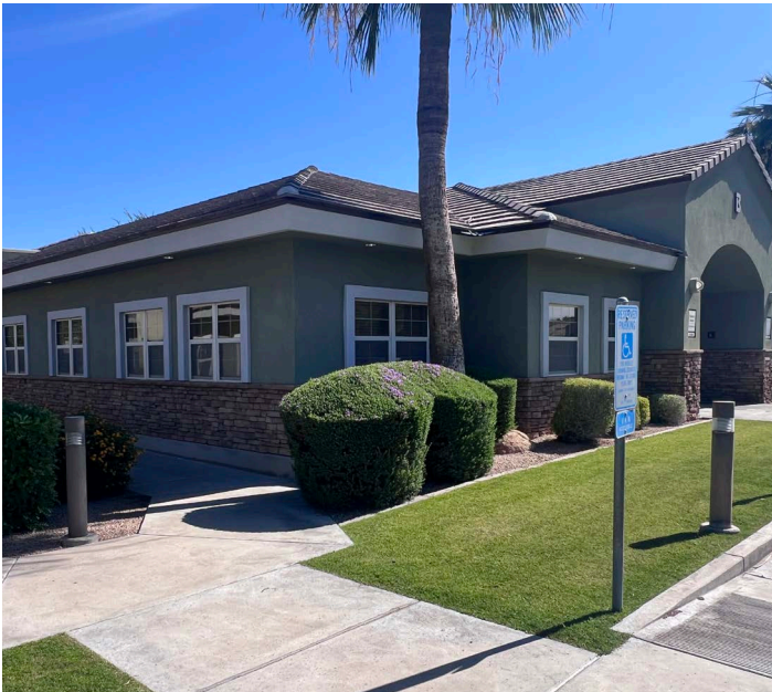
Looking Northeast at Suite B103

14001 North 7th Street, Suite B103 Phoenix, Arizona 85022