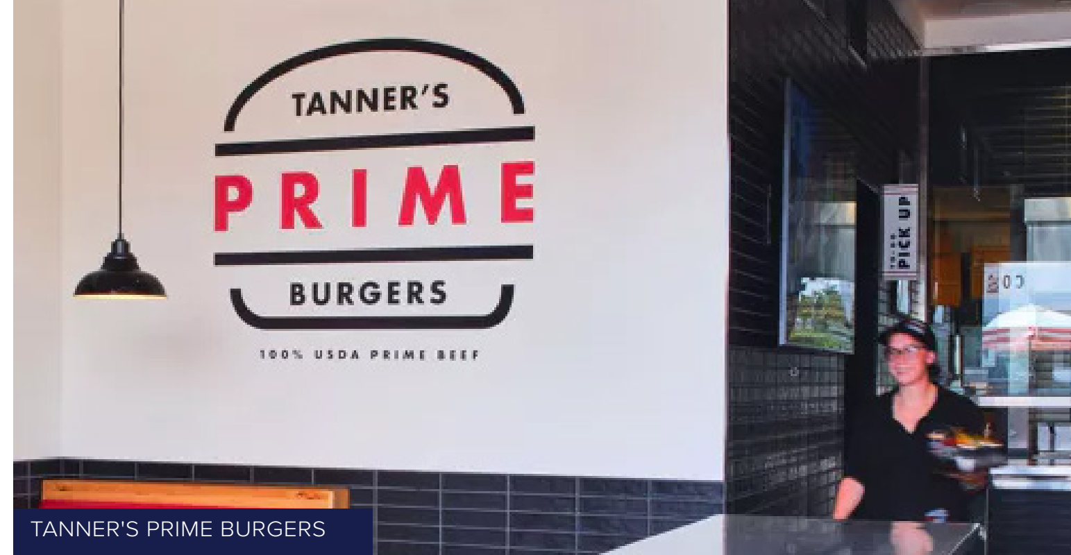
TANNER'S PRIME BURGERS