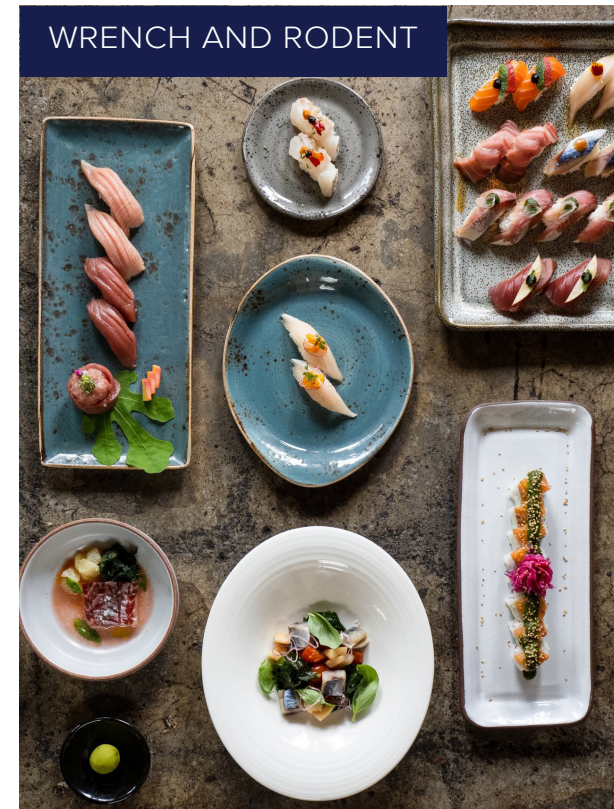
WRENCH AND RODENT