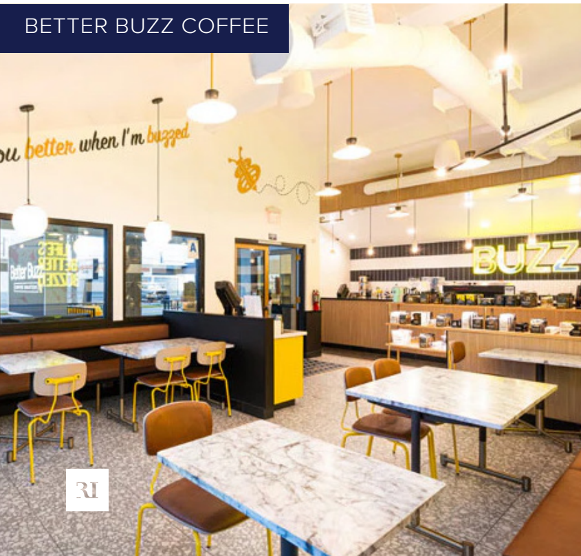
BETTER BUZZ COFFEE