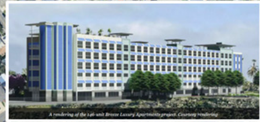
A rendering of the 146-unit Breeze Luxury Apartments project.