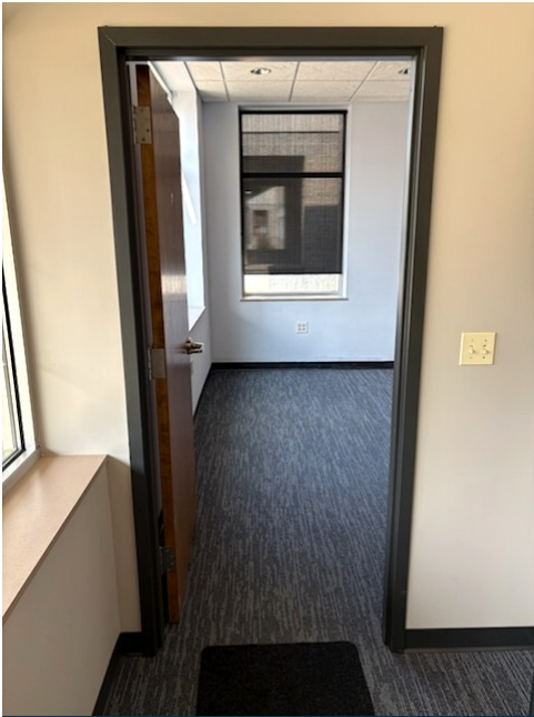
PRIVATE OFFICE 200 SF OFFICE SUITE