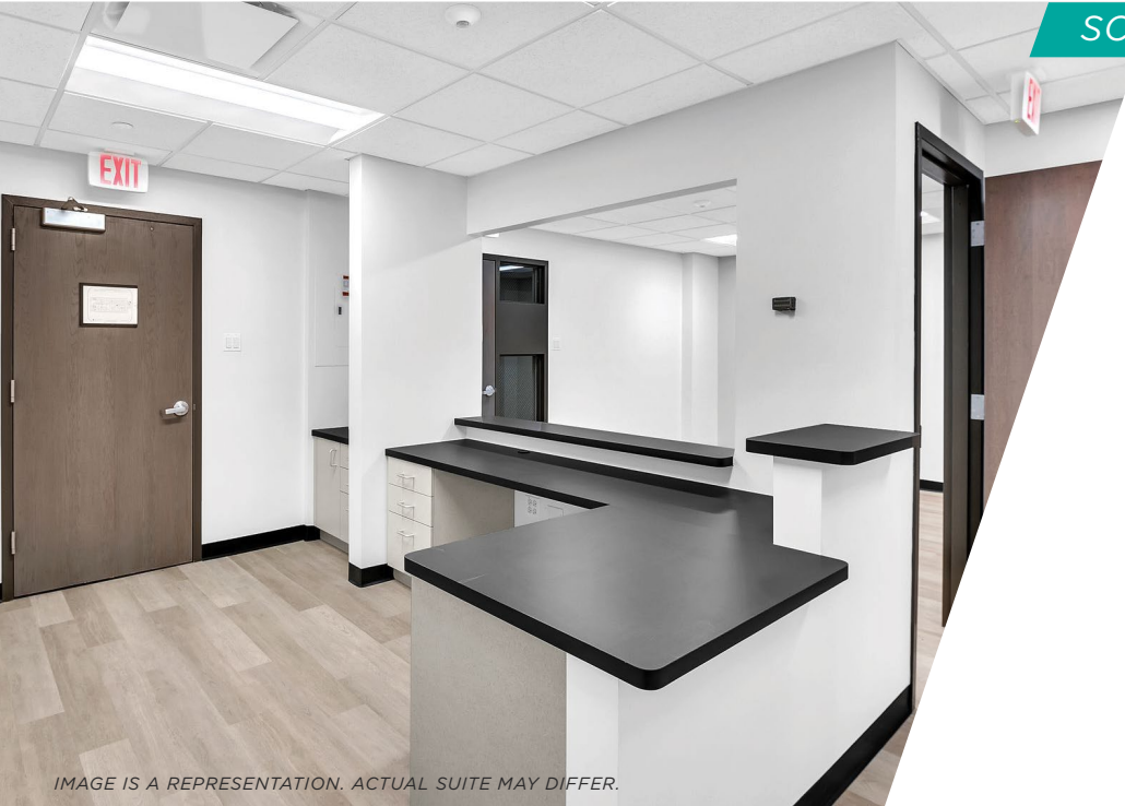
IMAGE IS A REPRESENTATION. ACTUAL SUITE MAY DIFFER.

Our SPEC suites combine convenience and quality in one perfect package. With sleek, modern finishes already in place, these suites are designed to be fully operational as soon as you move in. Skip the hassle and delays of construction and permitting —just move in and start seeing patients!