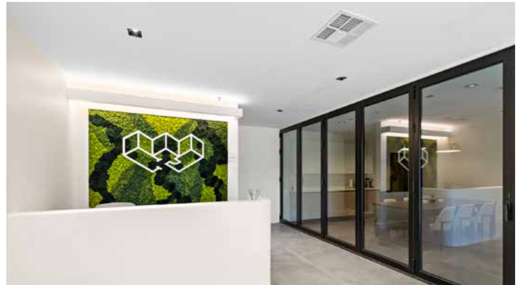
PRESERVED MOSS WALL DESIGNED BY CALIFORNIA PLANTSCAPES