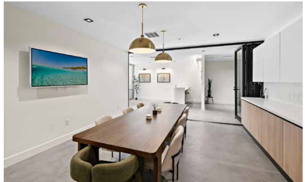
FURNISHINGS NEGOTIABLE & SEPARATE FROM THE LEASE