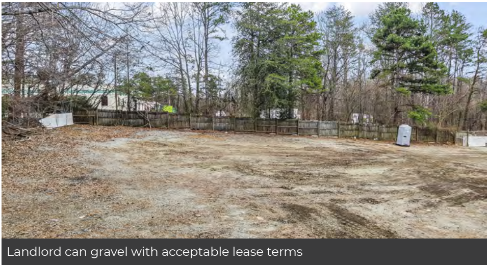
Landlord can gravel with acceptable lease terms