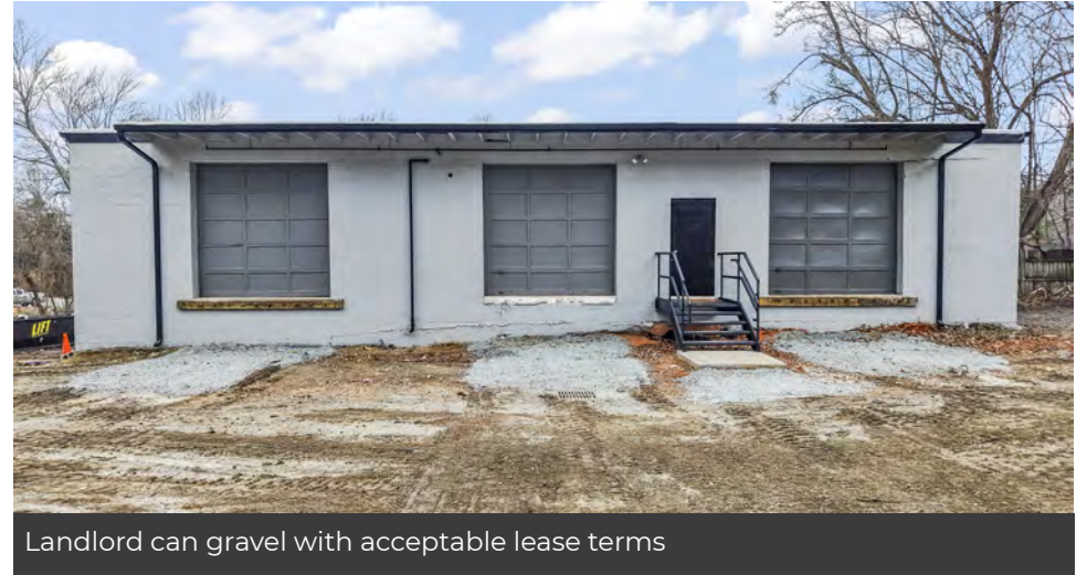
Landlord can gravel with acceptable lease terms