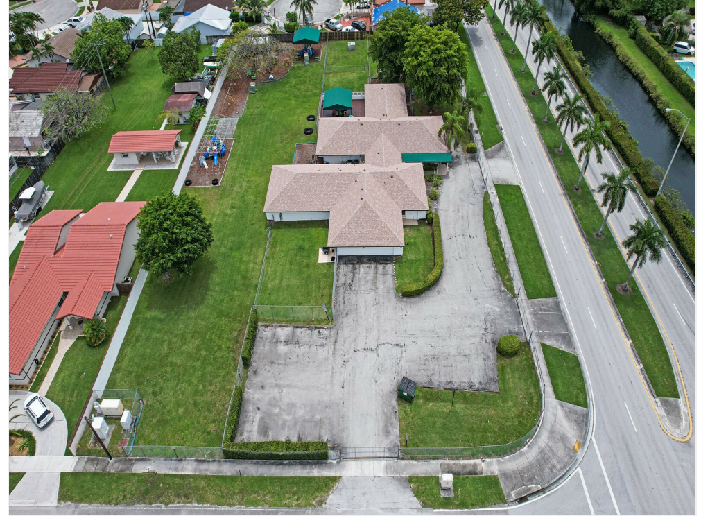
Expansive 1.4-Acre Lot