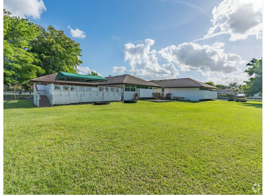
Large Lot Space