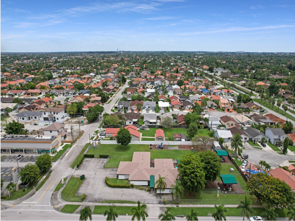
Situated in Miami's Kendall Community