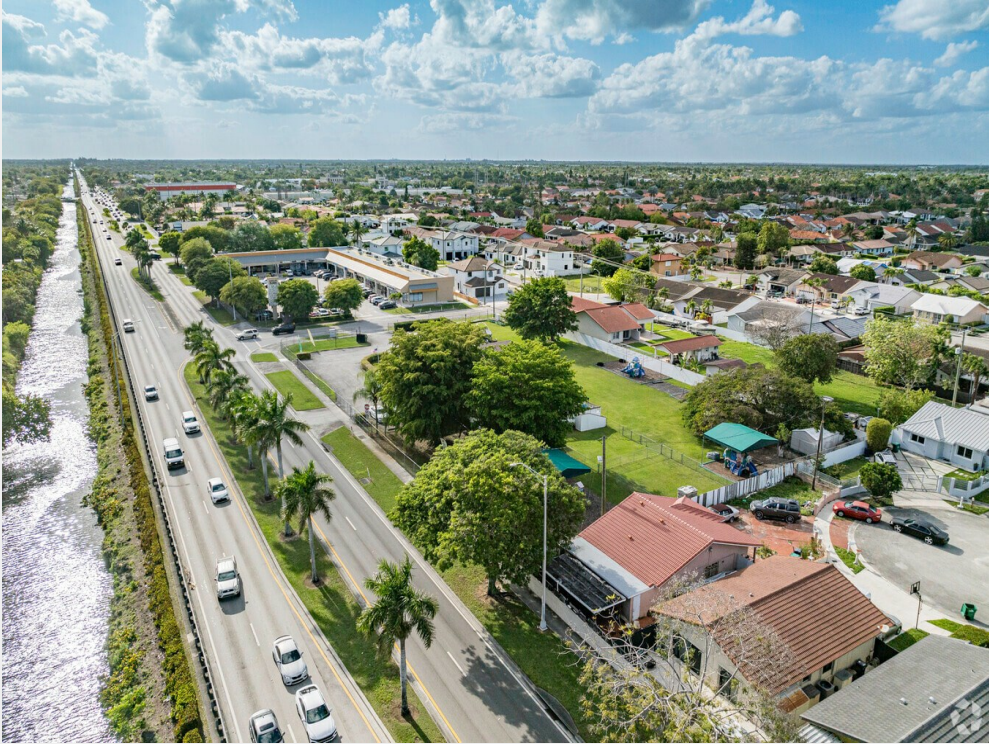
Excellent Access along SW 42nd Street