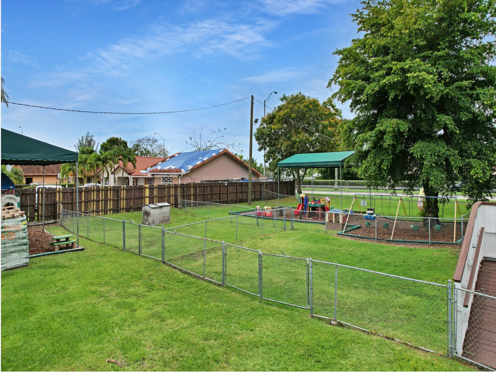
Prime for Expansion or Redevelopment