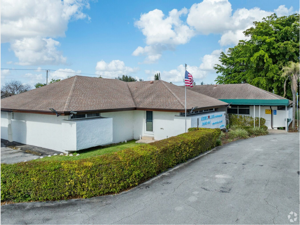
Currently Occupied by a Daycare Center