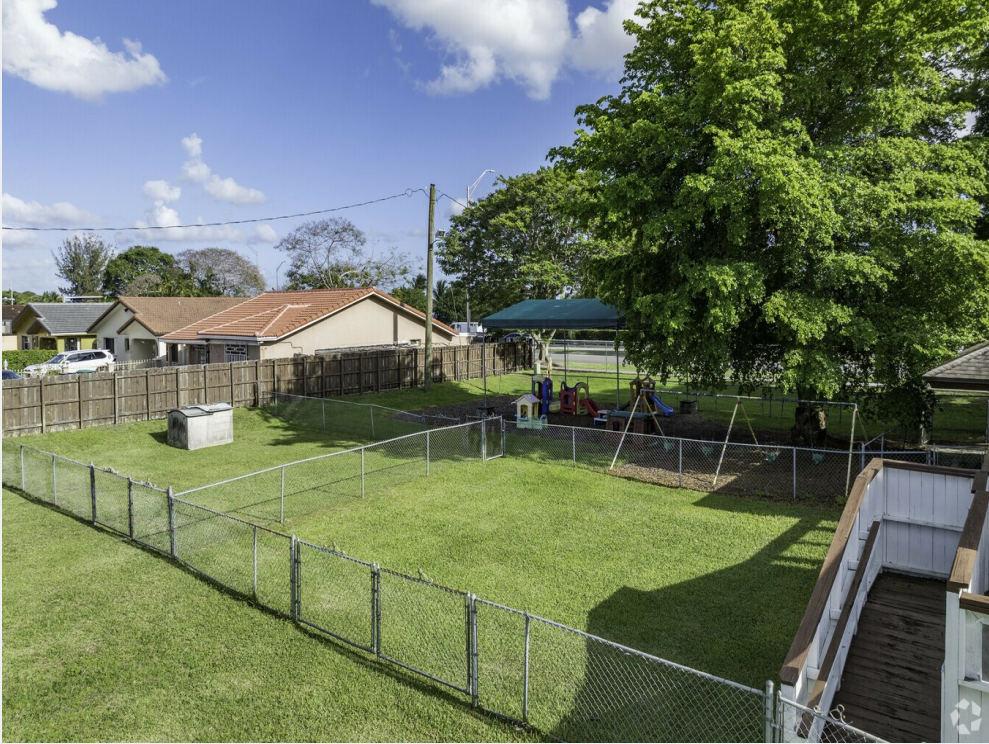
Prime for Expansion or Redevelopment