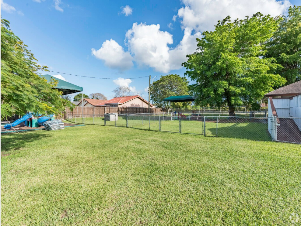
Prime for Expansion or Redevelopment