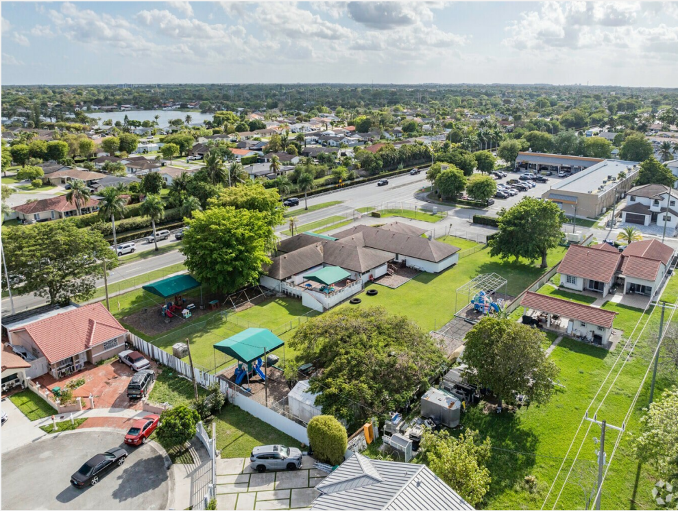
Surrounded by Single-Family Neighborhoods