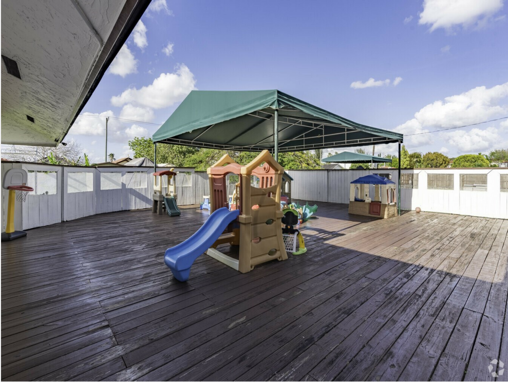
Patio Play Area