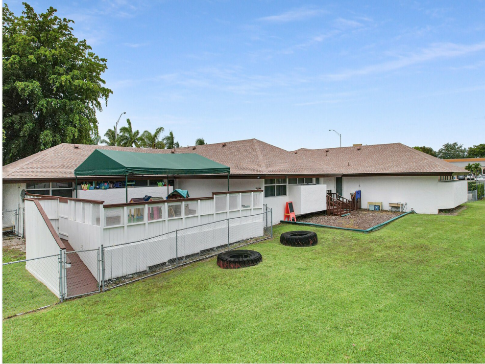
In Operation for 30 Years