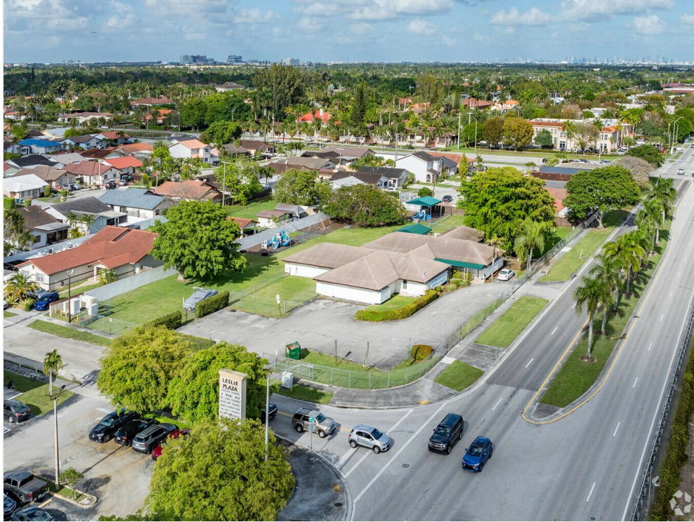
13291 SW 42nd Street in Miami, Florida