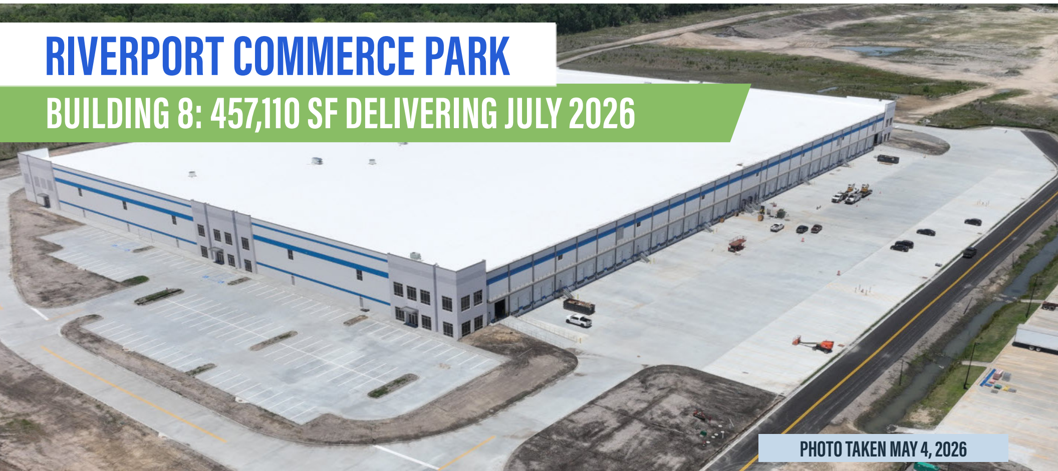
PHOTO TAKEN MAY 4, 2026

BUILDING 8: 457,110 SF DELIVERING JULY 2026