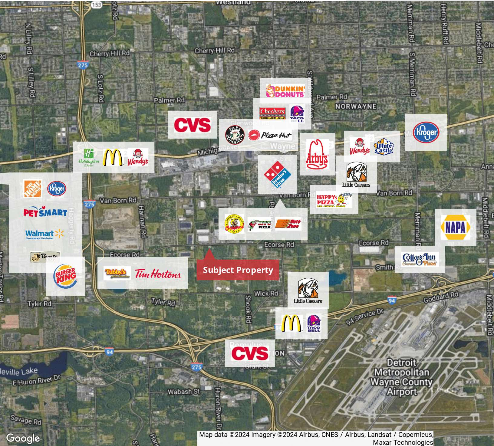
Map data ©2024 Imagery ©2024 Airbus, CNES / Airbus, Landsat / Copernicus, Maxar Technologies