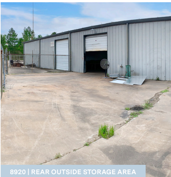
8920 | REAR OUTSIDE STORAGE AREA