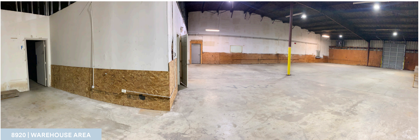
8920 | WAREHOUSE AREA