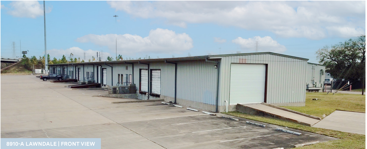
8910-A LAWDALE | FRONT VIEW