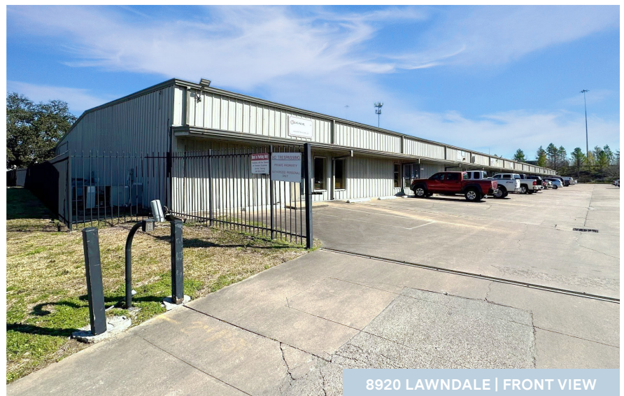
8920 LAWDALE | FRONT VIEW

The information contained herein has been given to us by the owner of the property or other sources we deem reliable, we have no reason to doubt its accuracy, but we do not guarantee it. All information should be verified prior to purchase or lease. ©2026 Partners. All rights reserved.