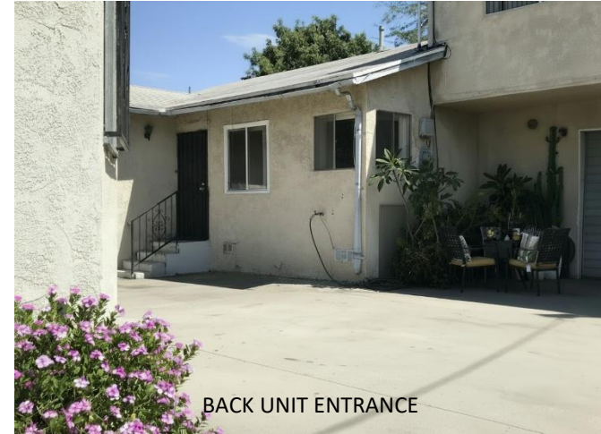
BACK UNIT ENTRANCE