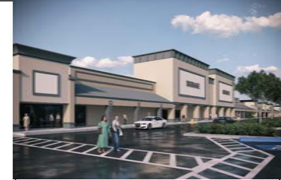
RIDGEPORT PLAZA Naples, Florida