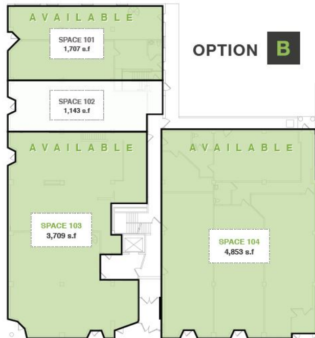
MAIN LEVEL SPACES 101 - 104 SCALE: 1/16" = 1'-0"