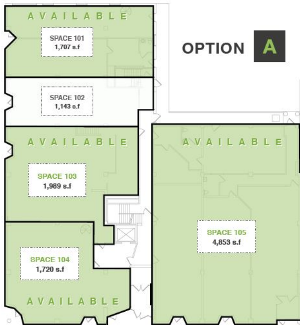
MAIN LEVEL SPACES 101 - 105 SCALE: 1/16" = 1'-0"