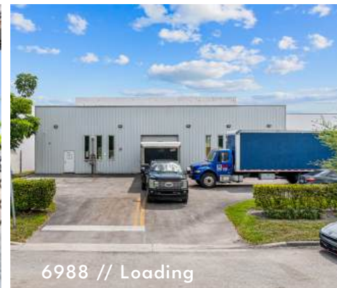
6988 // Loading