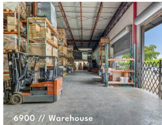
6900 // Warehouse