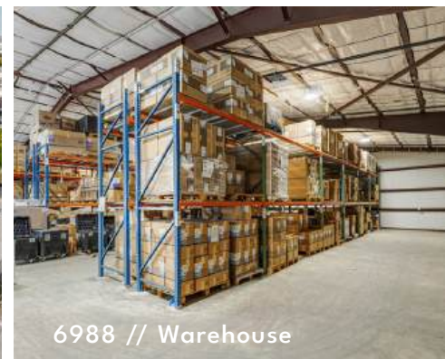
6988 // Warehouse