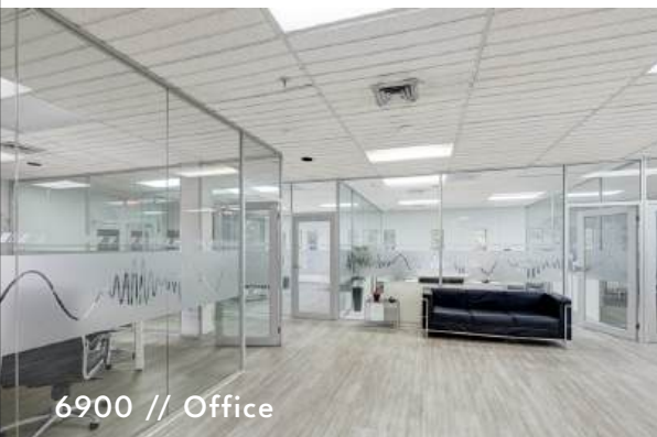
6900 // Office