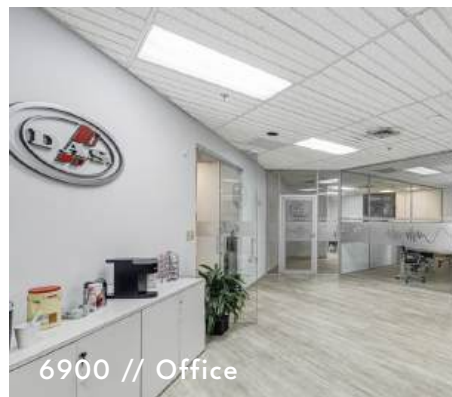
6900 // Office