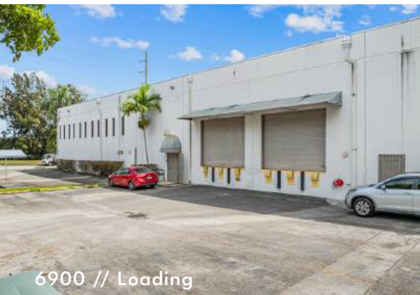
6900 // Loading