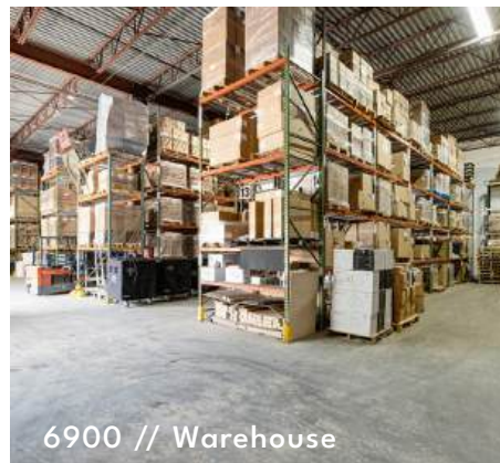
6900 // Warehouse