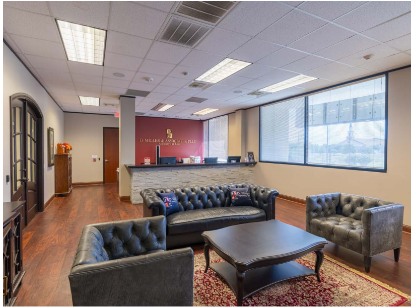
2ND FLOOR RECEPTION