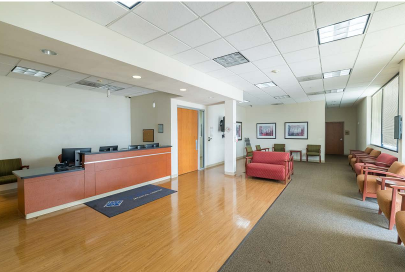
1ST FLOOR MEDICAL