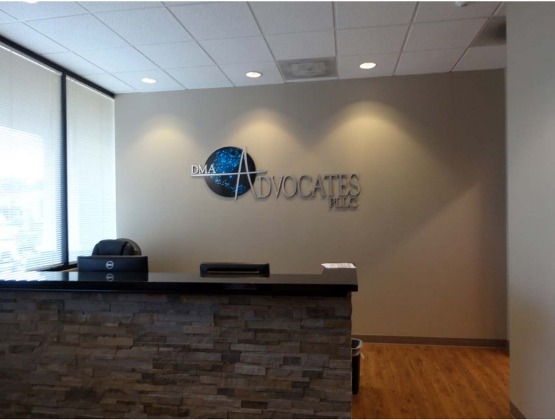
1ST FLOOR RECEPTION

2610 W. Sam Houston Parkway South, Houston, Texas