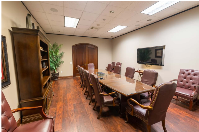
2ND FLOOR CONFERENCE