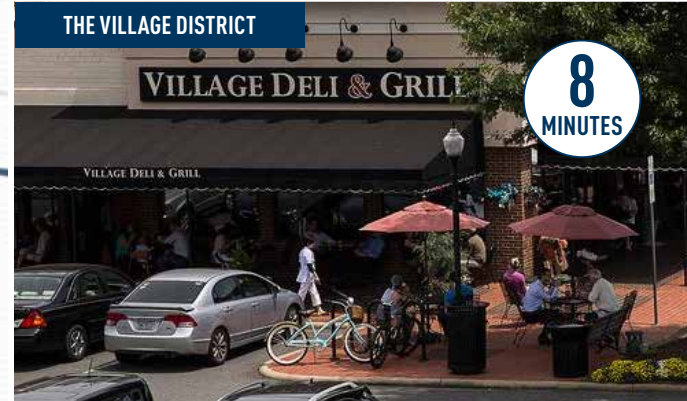
THE VILLAGE DISTRICT