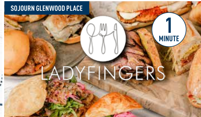
SOJOURN GLENWOOD PLACE