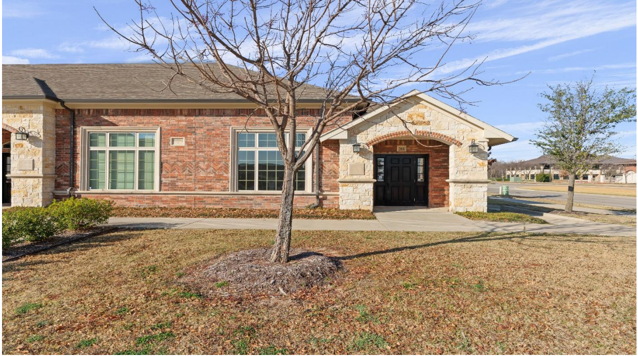
Private Entrance, Corner Unit