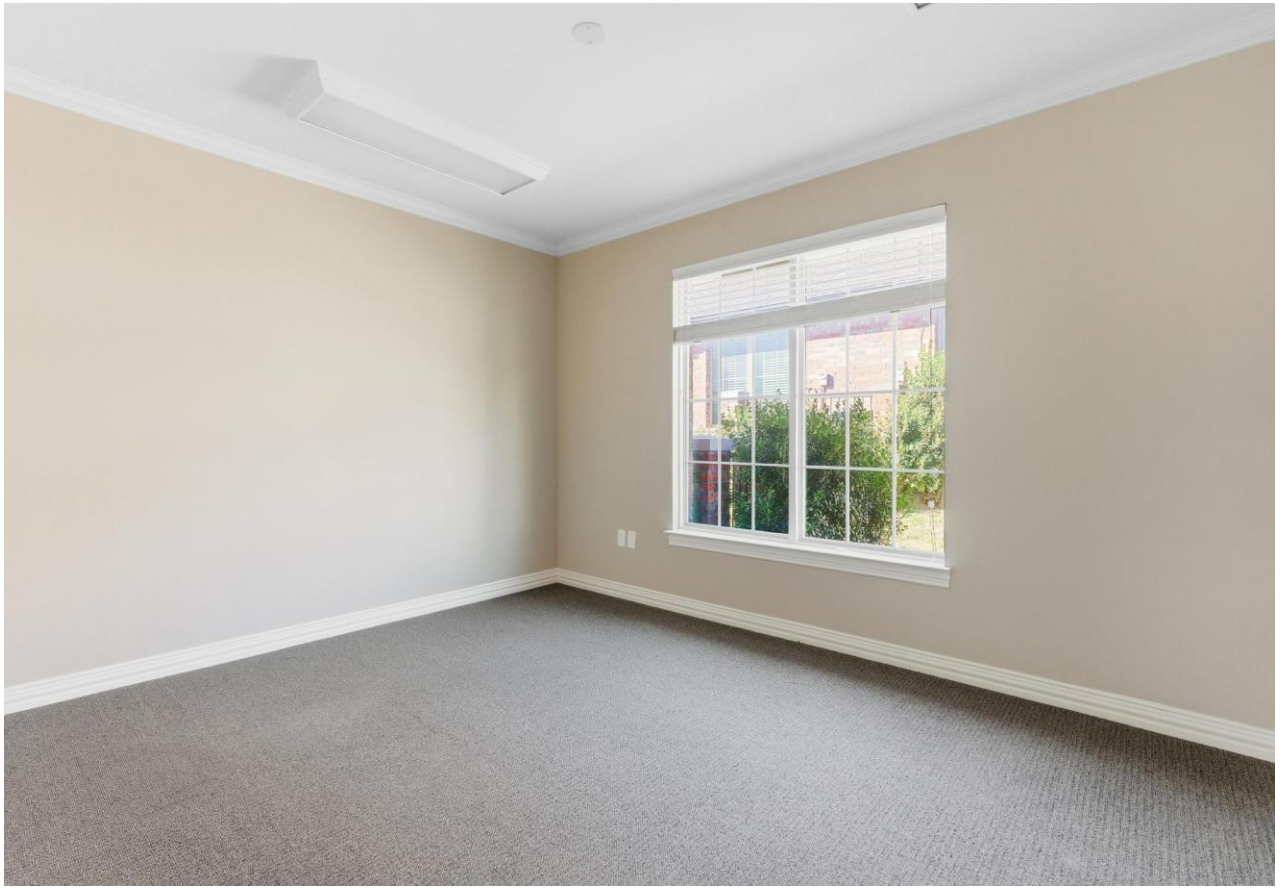
Office # 4