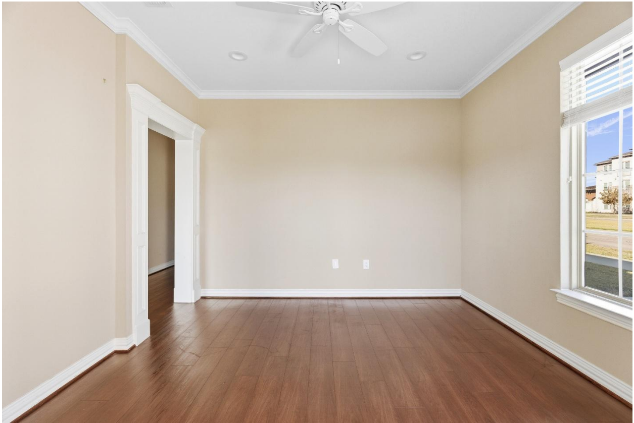
Front Office and Lobby