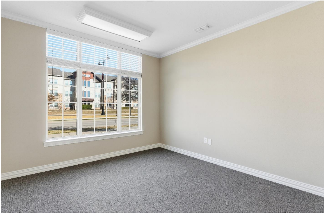
Office # 2