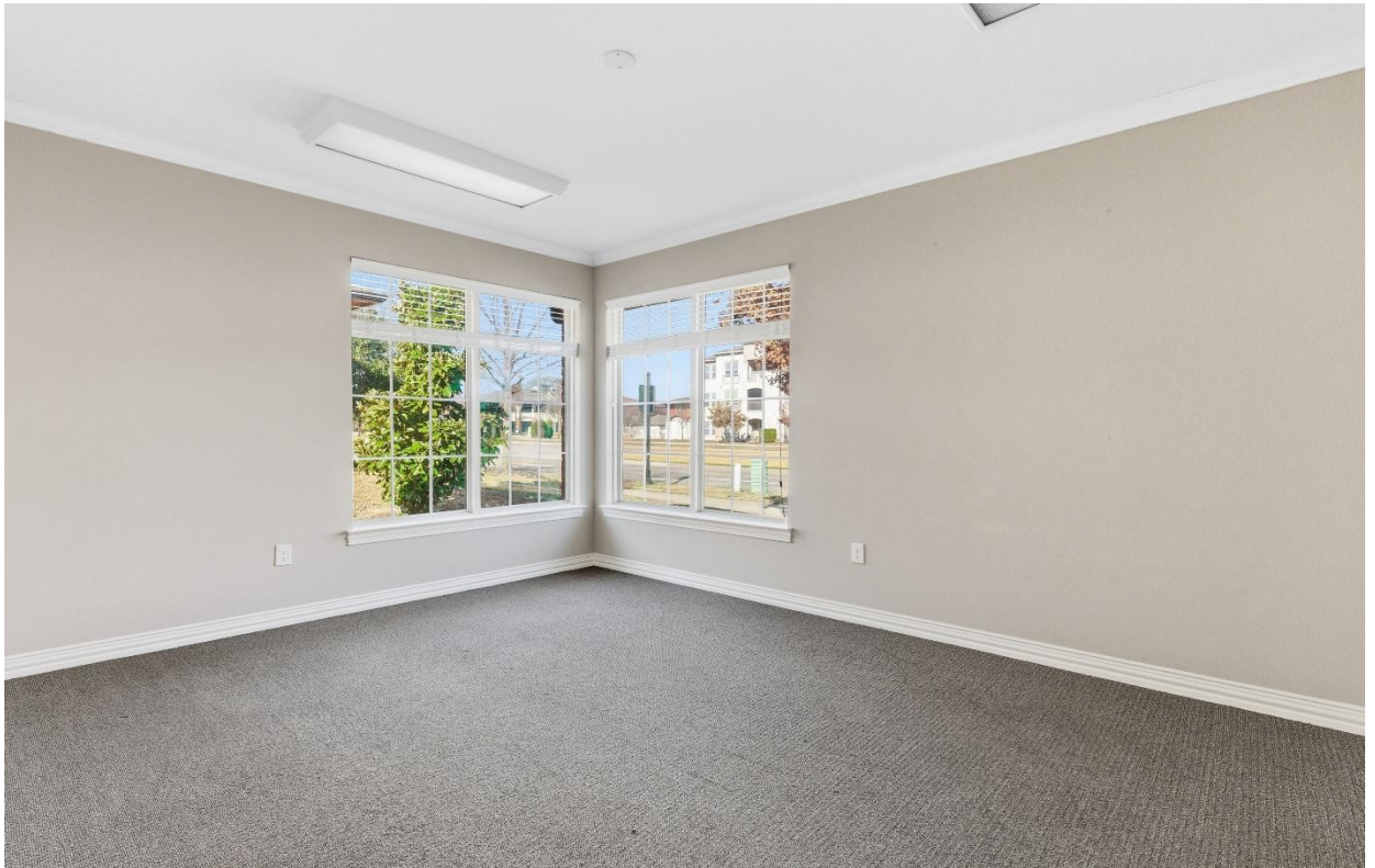
Office # 3