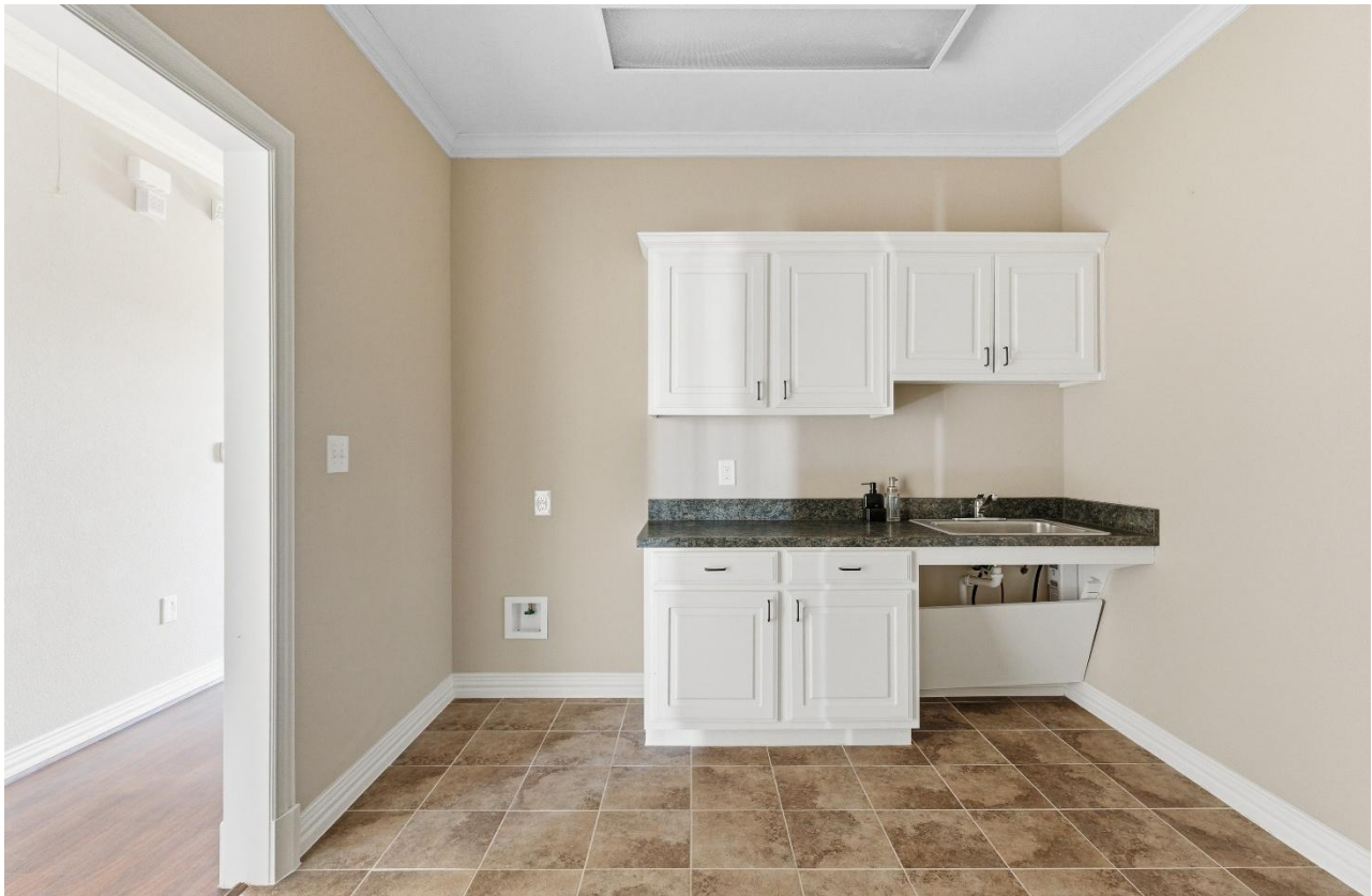
Large Break Room