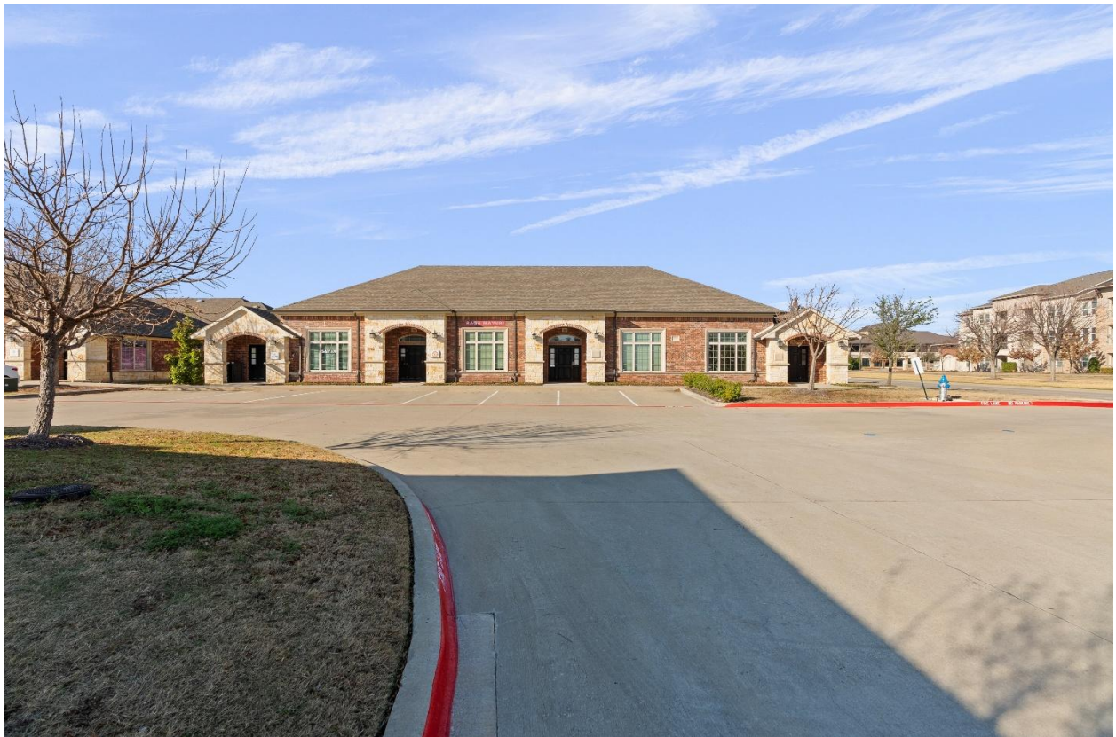
Upscale Office Park- Open Space and Plenty of Parking Spots