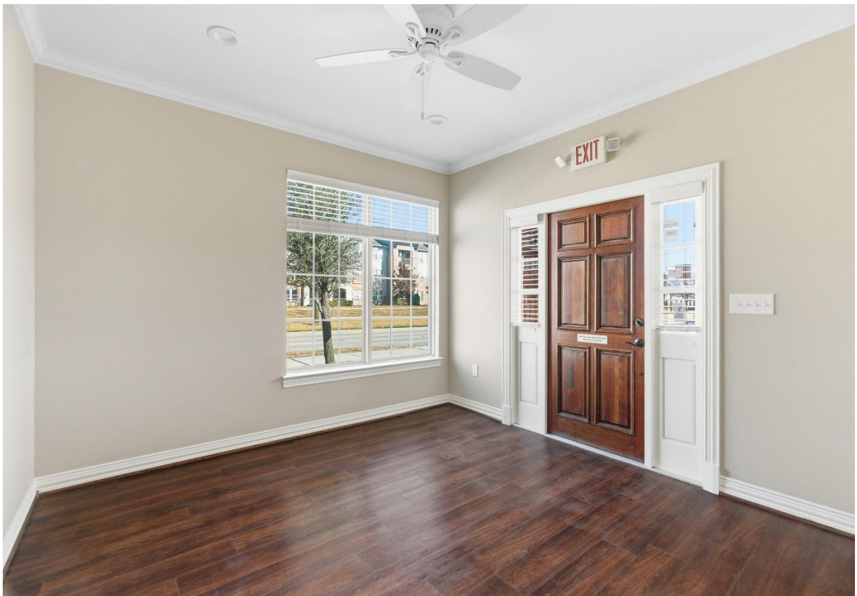
Front Office and Lobby