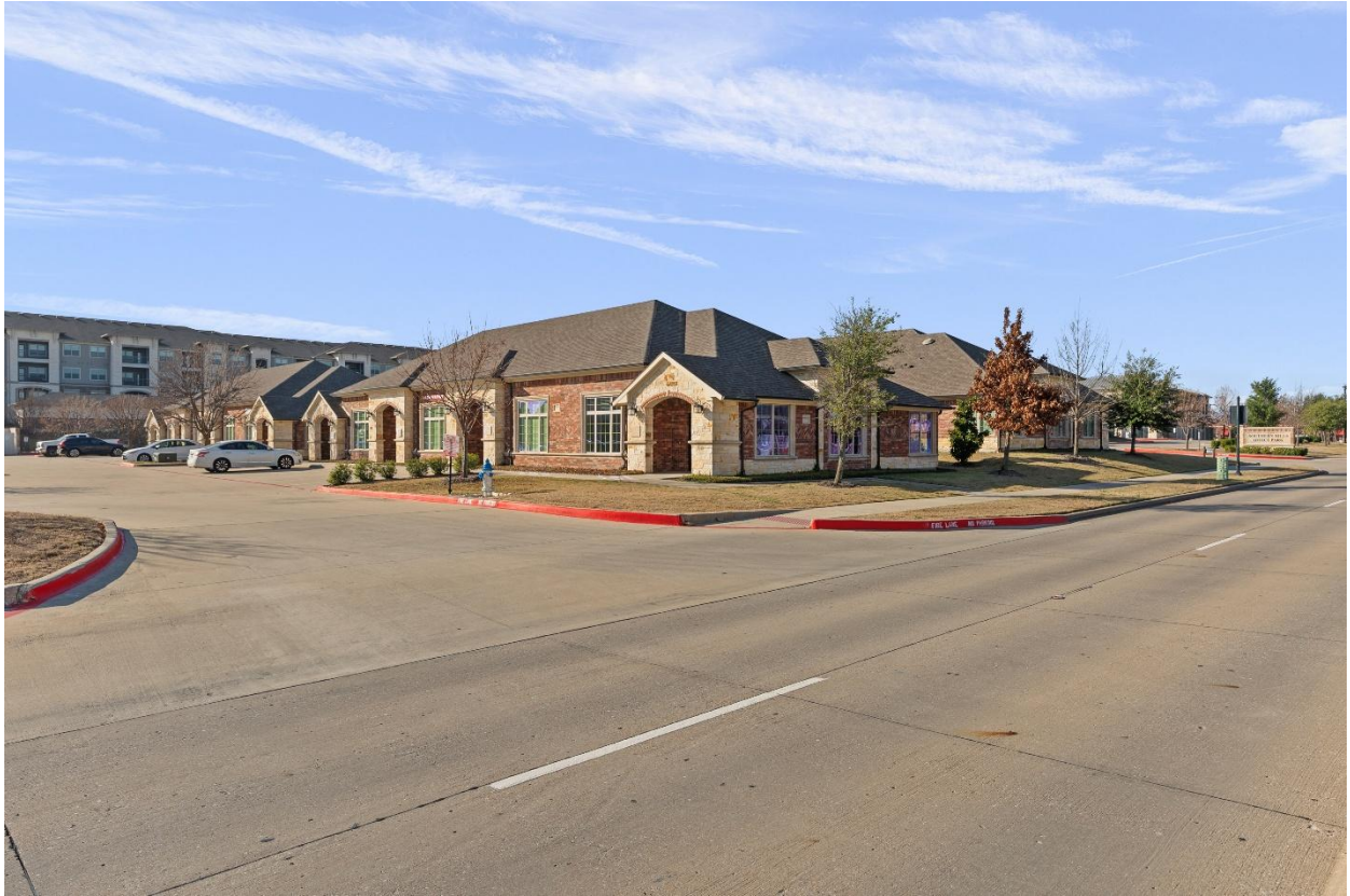
Right by the Road – Highest Visibility