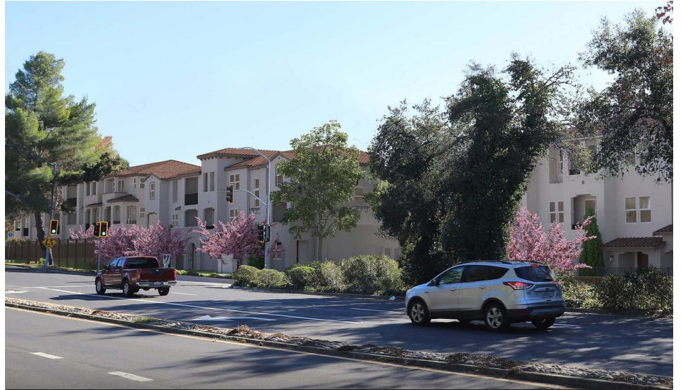
RENDERINGS BY SDG ARCHITECTS