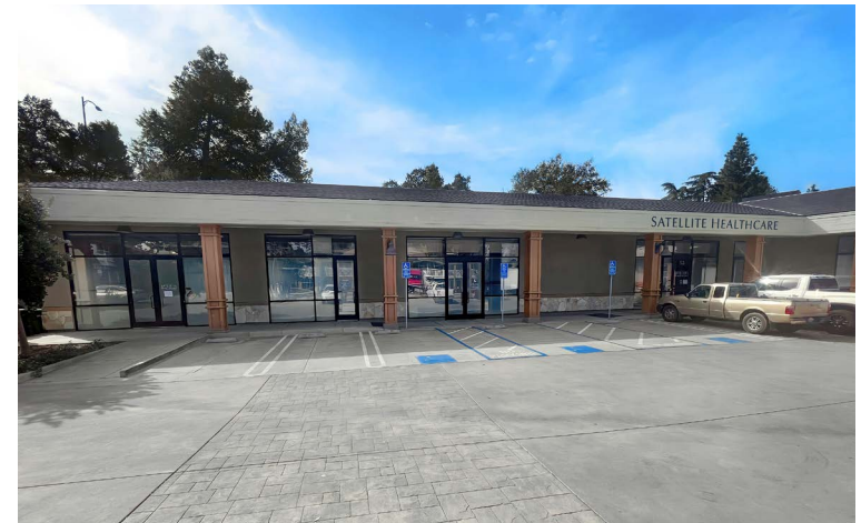
53 SARATOGA-LOS GATOS RD, LOS GATOS, CA