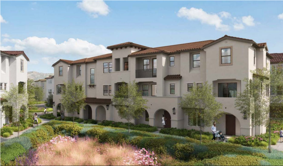
RENDERINGS BY SDG ARCHITECTS