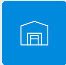
Cross Dock Facility