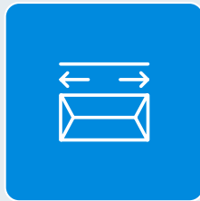
Two large concrete yards