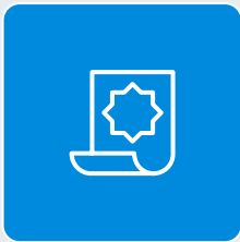
Class 1 open storage site