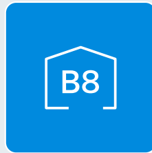
Unrestricted B8 use