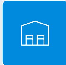
44 tailboard height loading docks