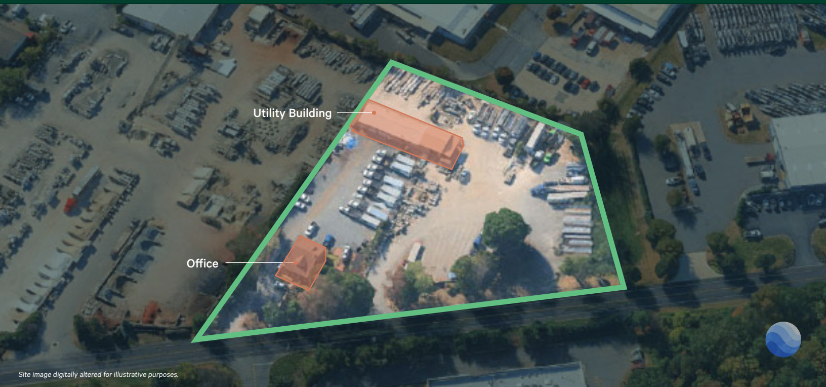
Site image digitally altered for illustrative purposes.

Strategic IOS Hub: Great Access to I-287, Route 22, and Port Newark.