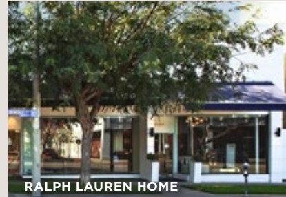
RALPH LAUREN HOME