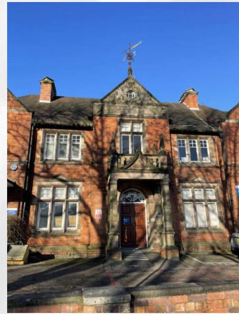
External Façade of Smallwood House