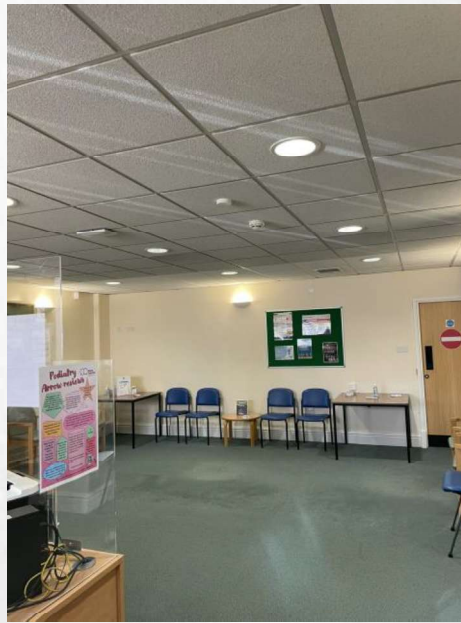
Former clinic area within Smallwood House