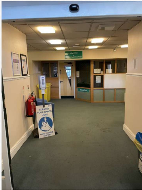
Reception area within Smallwood House

SMALLWOOD HOUSE, CHURCH GREEN WEST, REDDITCH, WORCESTERSHIRE, B97 4DJ