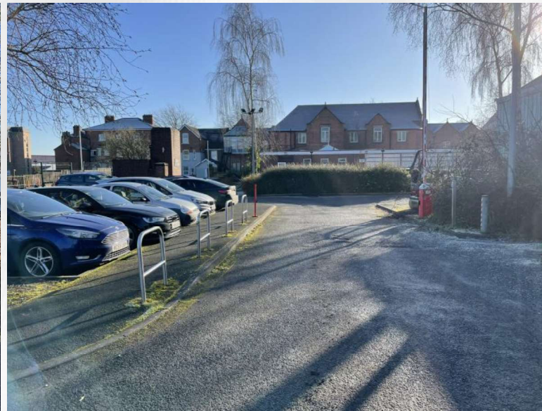
Rear Façade and further development land, currently used as car parking