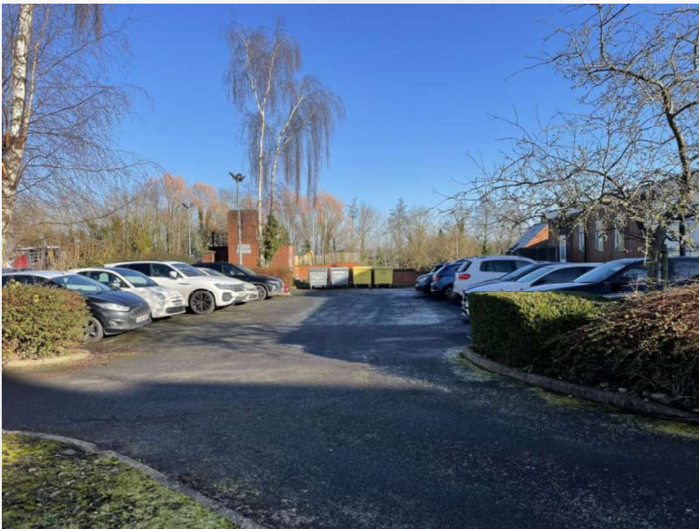
Land to the rear of Smallwood House, formerly used as car parking