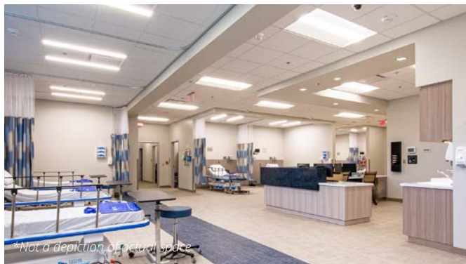
*Not a depiction of actual space