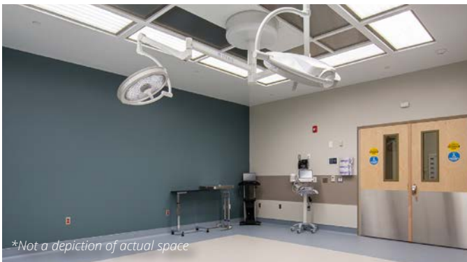
*Not a depiction of actual space

Located in the heart of Roseville's medical community, 1386 Lead Hill Boulevard is strategically situated amongst some of the most prominent healthcare medical groups in the industry. The Property is a mere 0.8 miles from the Kaiser Roseville Hospital, a 49-acre campus encompassing 1 million square feet of medical facilities with a total of 340 hospital beds. Kaiser continues to expand their Roseville presence with their newest \pm 210,000 medical office project on Riverside Avenue and Cirby Way. Sutter Health also occupies a large portion of the Roseville medical market with a \pm 810,000 square foot hospital and medical center campus. The Sutter campus is located on \pm 57 acres and houses 328 hospital beds. Dignity Health also has a presence in the market, including a new women's imaging center located 1.4 miles from the subject property.