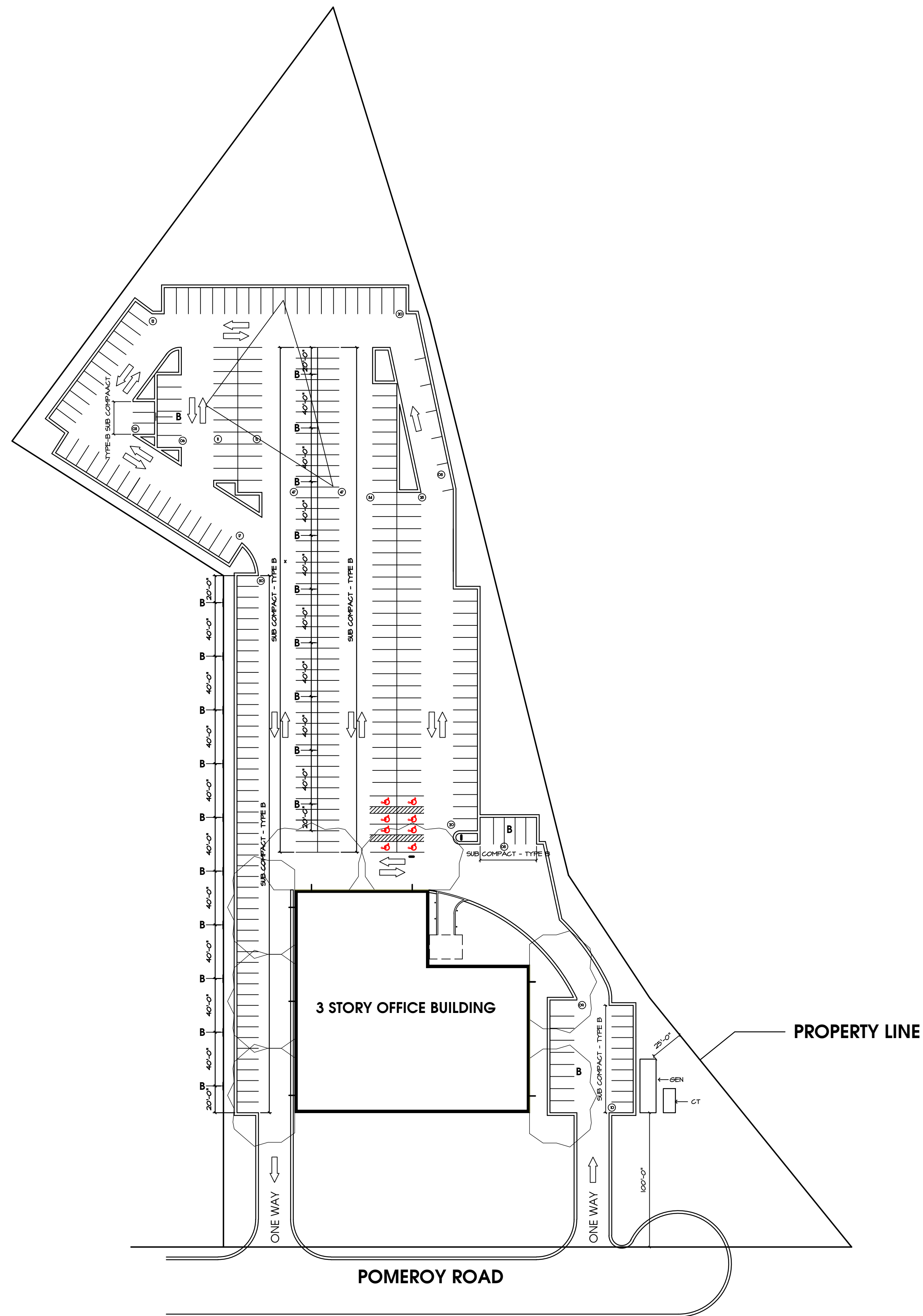
Plan scale: 1" = 50'-0"