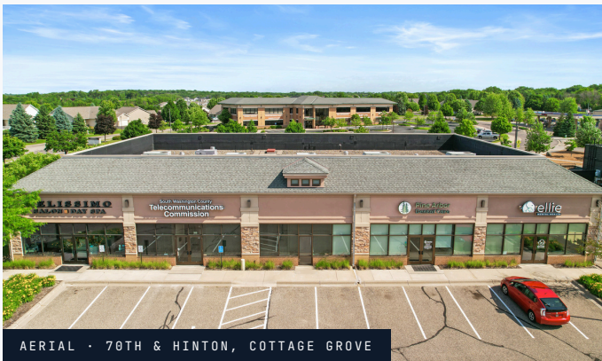
AERIAL · 70TH & HINTON, COTTAGE GROVE

Option to subdivide into two smaller suites of approximately 1,600 SF and 1,900 SF should a tenant prefer a smaller footprint. Lease rate negotiated based on size required — reach out for more information.