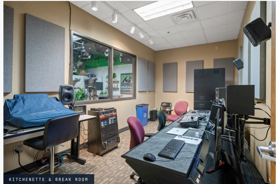
KITCHENETTE & BREAK ROOM