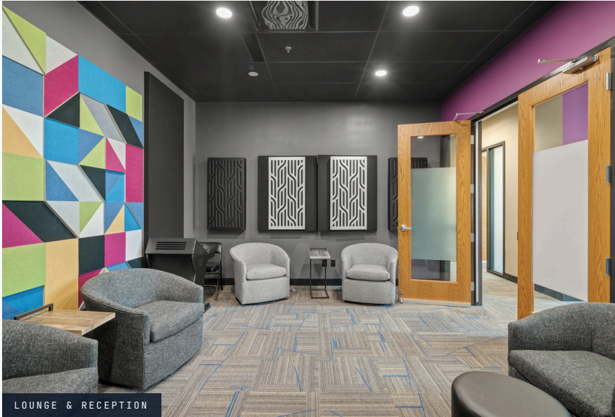
LOUNGE & RECEPTION

6939 PINE ARBOR LN S · STE 106 COTTAGE GROVE, MN 55016