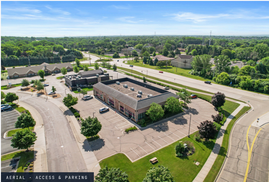
AERIAL · ACCESS & PARKING