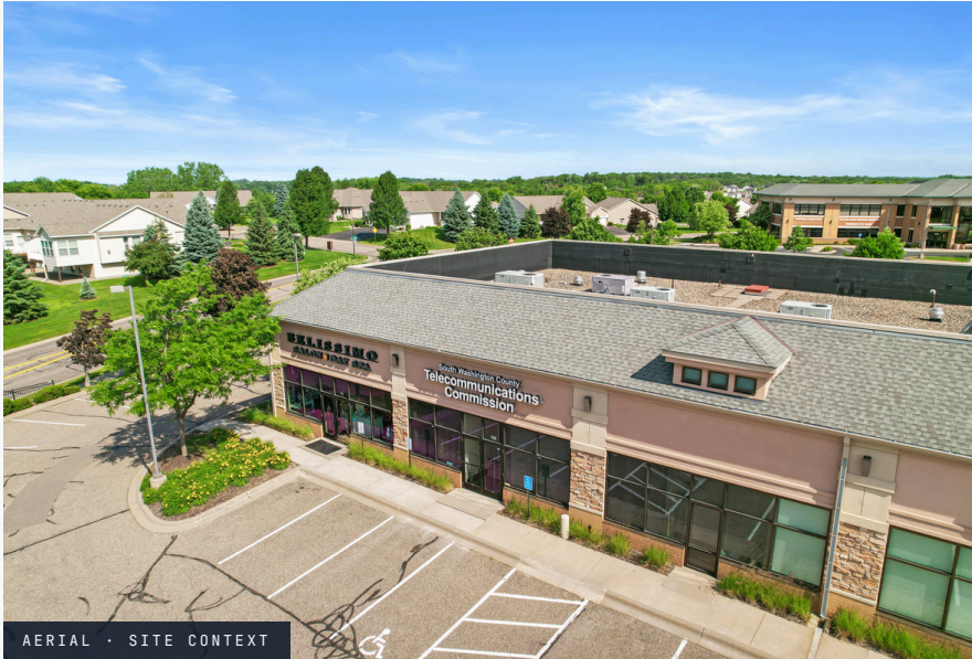
AERIAL · SITE CONTEXT

6939 PINE ARBOR LN S • STE 106 COTTAGE GROVE, MN 55016