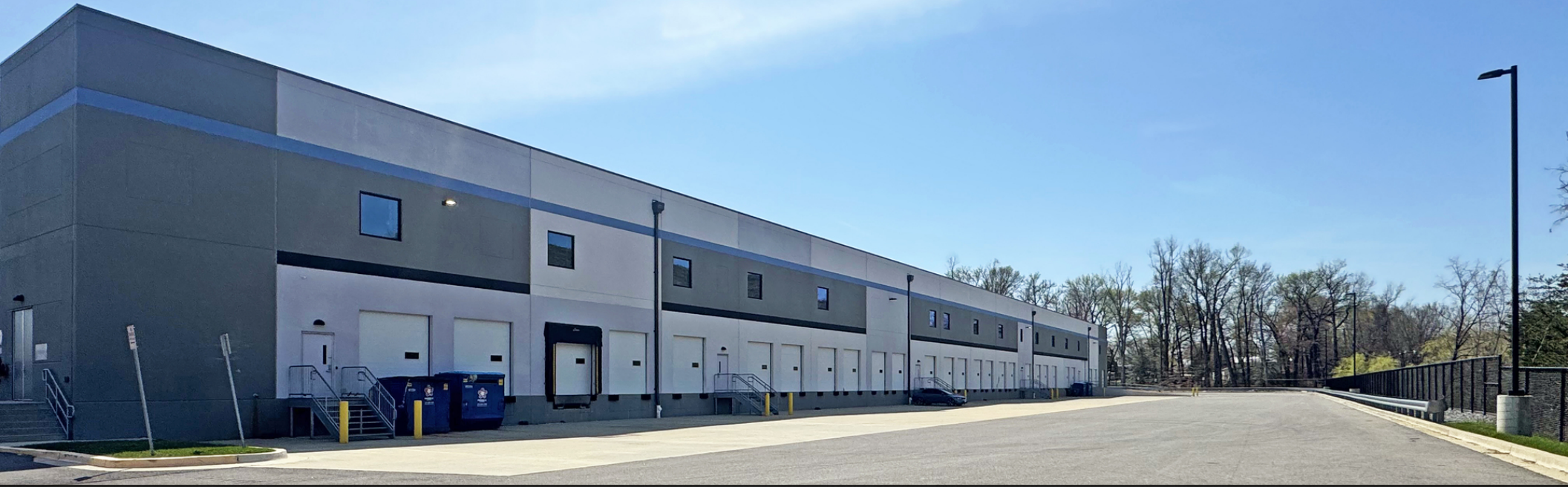
Ample loading area

6001 FALLARD DRIVE, UPPER MARLBORO, MD 20772