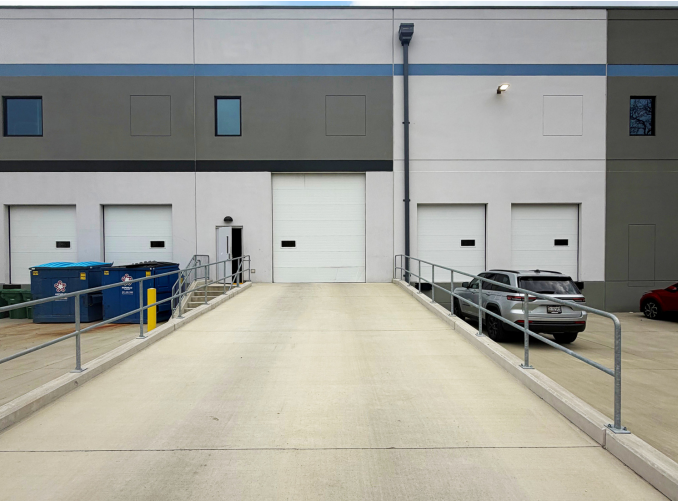
Suite 140 loading