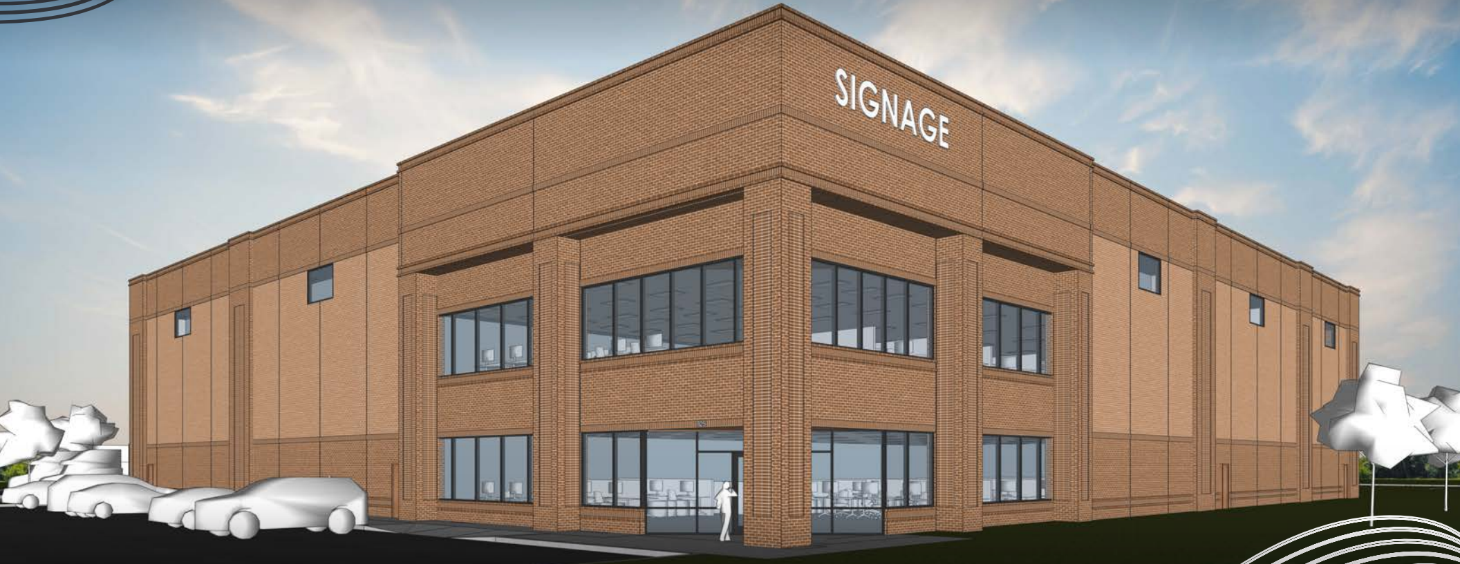
RENDERING PERSPECTIVE VIEW 1

NAI James E. Hanson COMMERCIAL REAL ESTATE SERVICES, WORLDWIDE