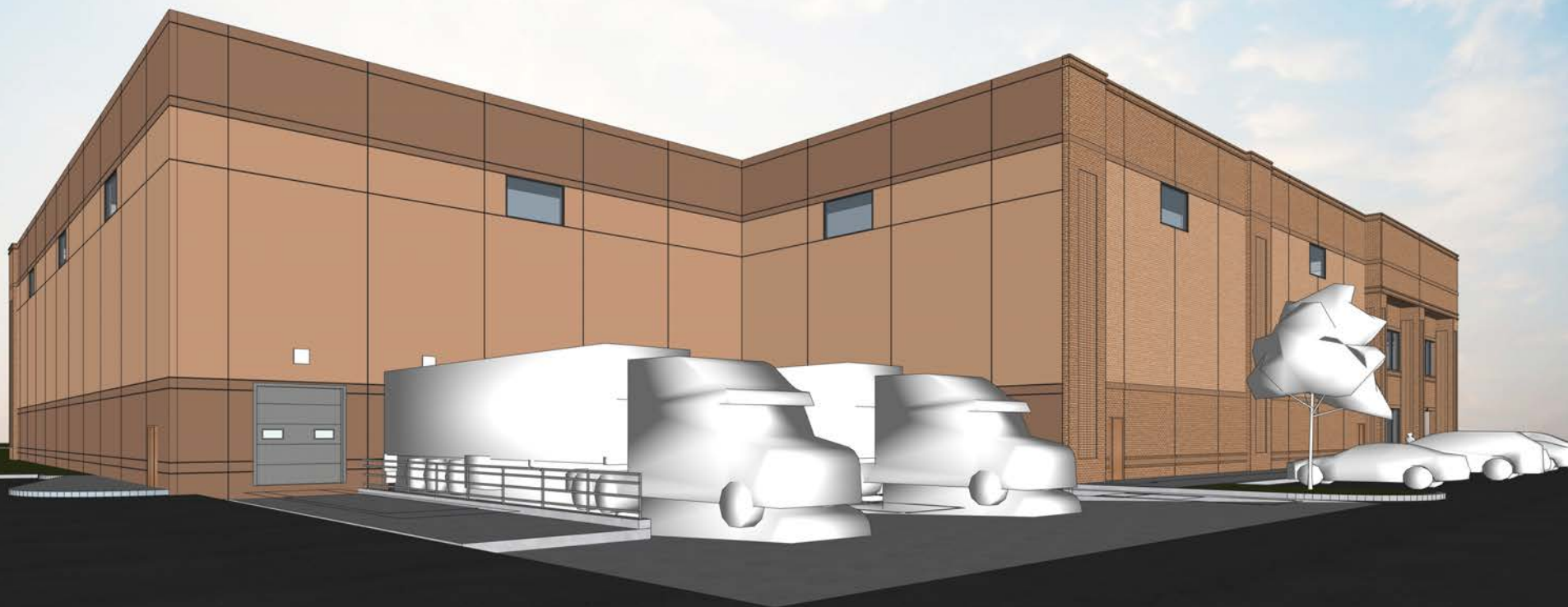
RENDERING PERSPECTIVE VIEW 2

725 Washington Ave CARLSTADT, NEW JERSEY