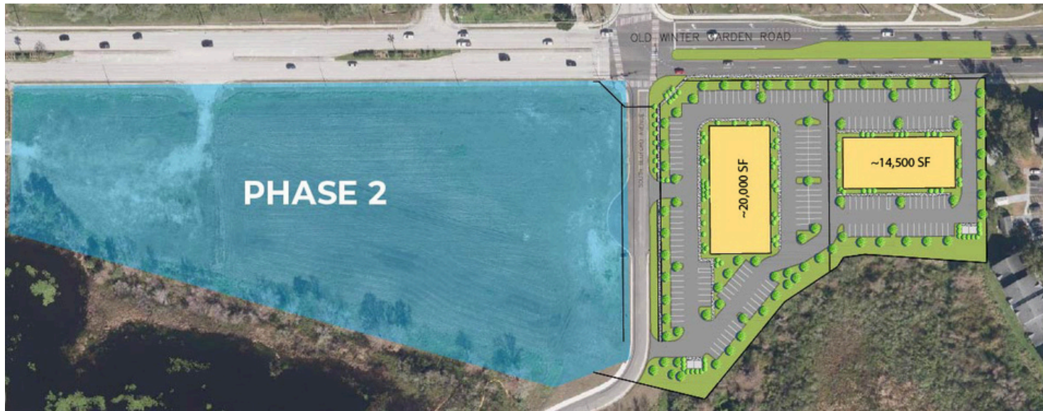
OPTION 1: 2 MEDICAL OFFICE BUILDINGS, TOTALING ~34,500 SF