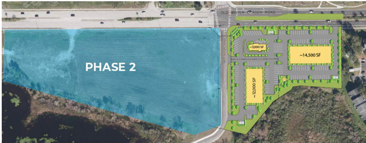
OPTION 2: 2 MEDICAL OFFICE BUILDINGS & 1 RETAIL BUILDING WITH DRIVE THRU, TOTALING ~29,500 SF

BRIAN ROTHSCHILD brothschild@trpcre.com Direct: 407-360-9735 Cell: 908-625-0393