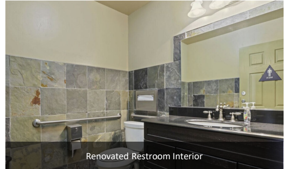
Renovated Restroom Interior