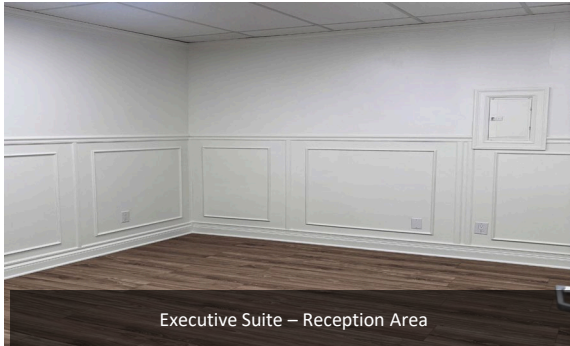
Executive Suite – Reception Area