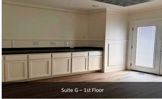
Suite G – 1st Floor