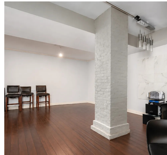
First Floor/Lower Level