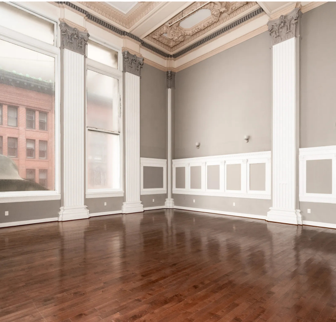
Live Work Office Suite