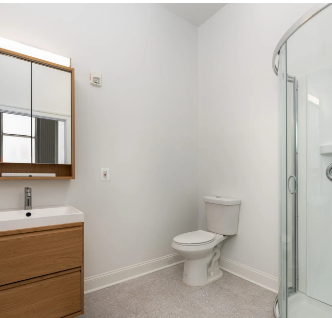
Live Work Office Suite