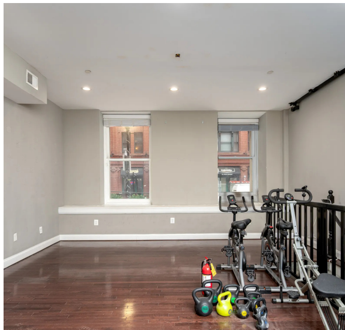
First Floor/Lower Level