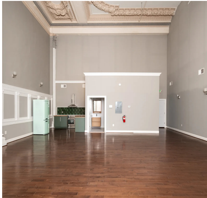
Live Work Office Suite