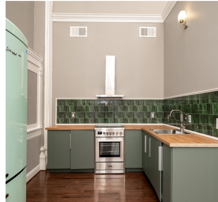
Live Work Office Suite