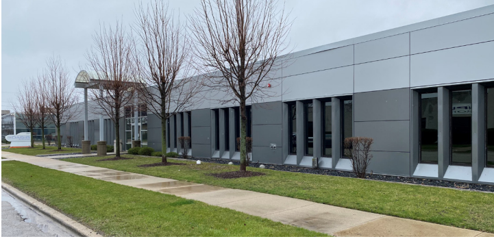
7447 W. WILSON AVE.