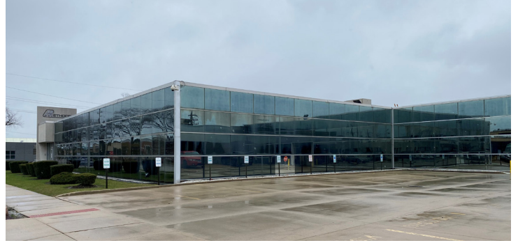
7401 W. WILSON AVE.